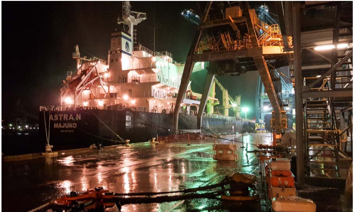
Figure 2 | Vessel Astra N at the Port of Esperance