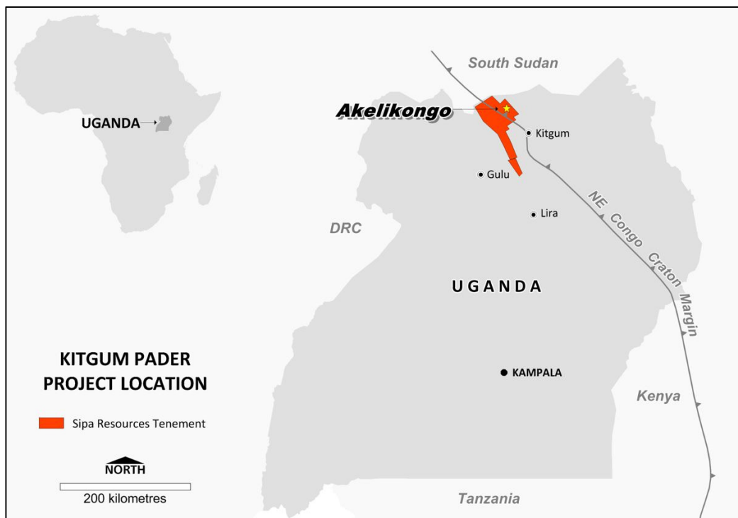
Figure 1- Kitgum Pader Project Location

"It is these attributes which make the project one of the most exciting greenfields nickel discoveries in recent years, and we are delighted that Rio Tinto have recognized this potential and will be funding the next stage of exploration."