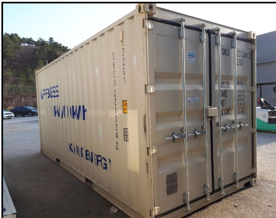
Figure 1: V-KOR 25kW (100kWh) unit

The V-KOR technology has received grant funding of approximately $120,000 from the Korean government for the development and testing of the V-KOR range of batteries in Australia. The grant has been issued by the Korea Institute of Energy Technology Evaluation and Planning (KETEP) which supports technical innovation in the energy sector.