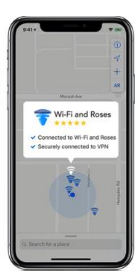
World Wi-Fi Version 2.0 for iOS

World Wi-Fi uses Norwood's global federated Wi-Fi network to give users access to millions of Wi-Fi access points in a simple, easy-to-use experience. The App features an innovative Augmented Reality interface to help users quickly and intuitively find nearby Wi-Fi hotspots, with a clear map to give users a clear understanding of their local coverage at a glance. Connection to the presented Wi-Fi networks is typically accomplished with just a few clicks, with an on-demand secure VPN automatically established, using the same technology as Norwood's World Secure product. World Secure and World Wi-Fi have been designed to work together so that there is always a single reliable VPN connection set up for the user, even if both Apps are installed on the one device.