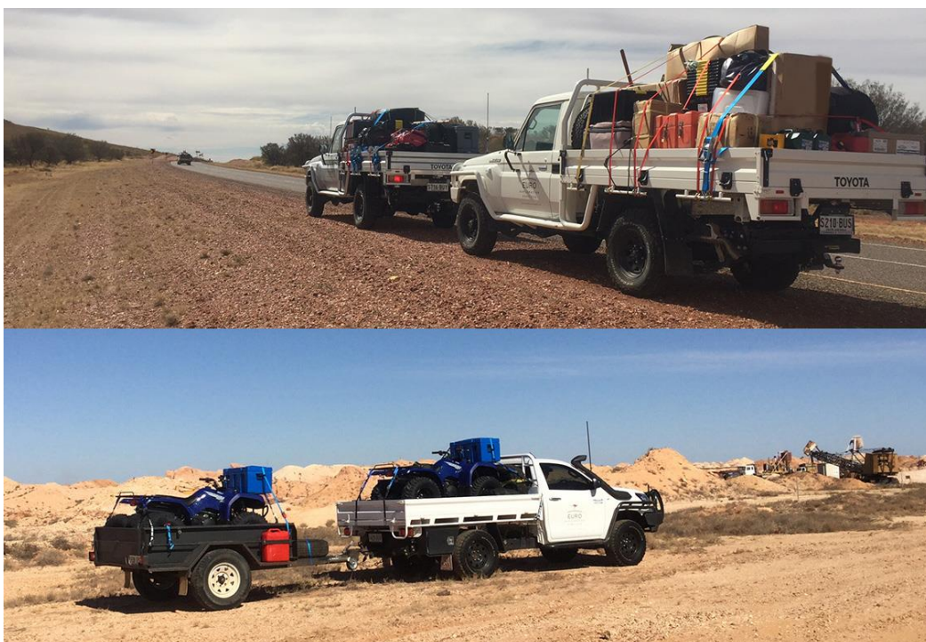
Two field teams have deployed this week

A six week soil sampling program has commenced to test areas of interest identified early in 2018 by Company geologists. Focussing initially in the northern area of the Alcoota Pegmatite Region ~ 150km NE of Alice Springs.