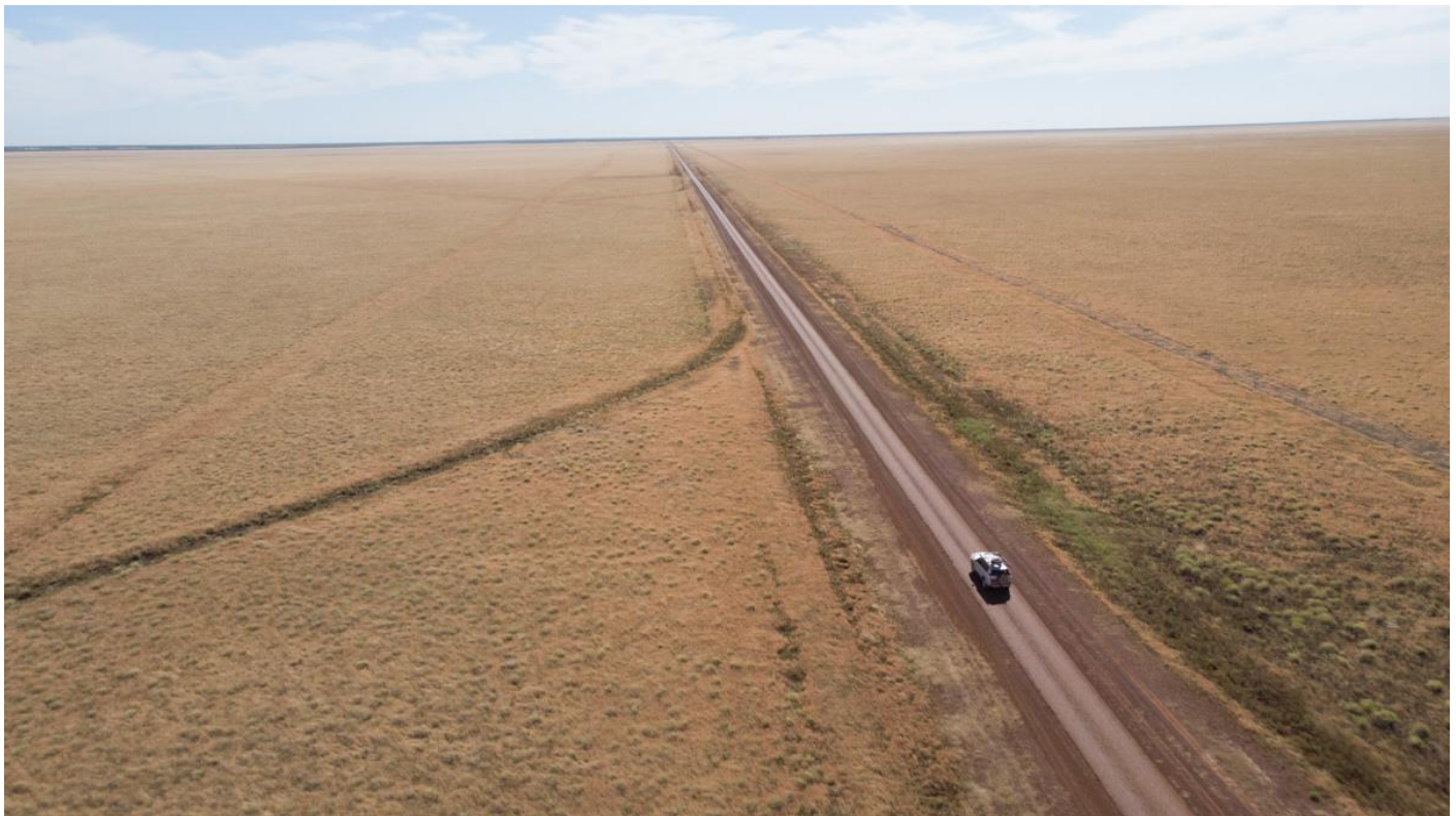
Northern Cobalt staff crossing the Barkley Tablelands (NT) towards the Wologorang Cobalt Deposit