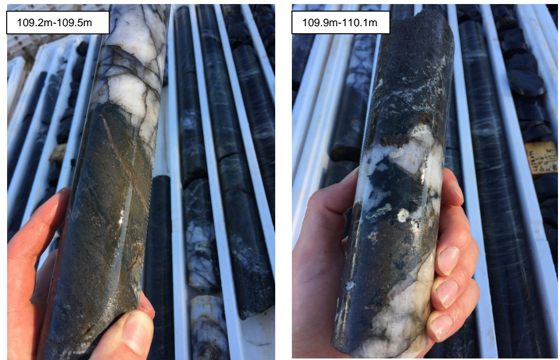
Figure 2 Examples of quartz veined sulphide altered BIF from diamond hole LEFR074