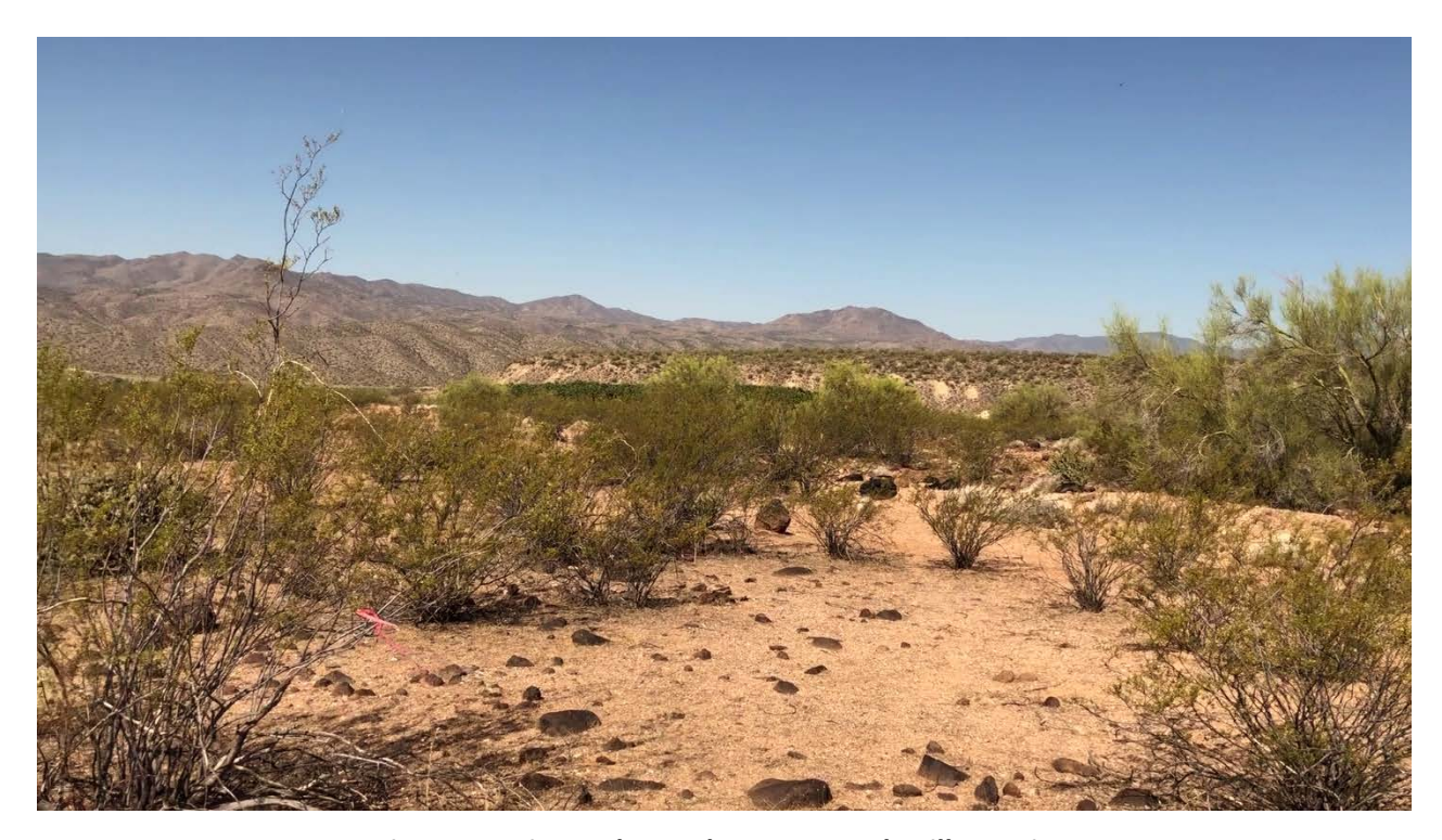
Figure 2 - Big Sandy - Hole 3 Approved Drill Location

We have engaged with local drilling contractors to finalise mobilisation logistics and expect the programme to commence in June 2018."