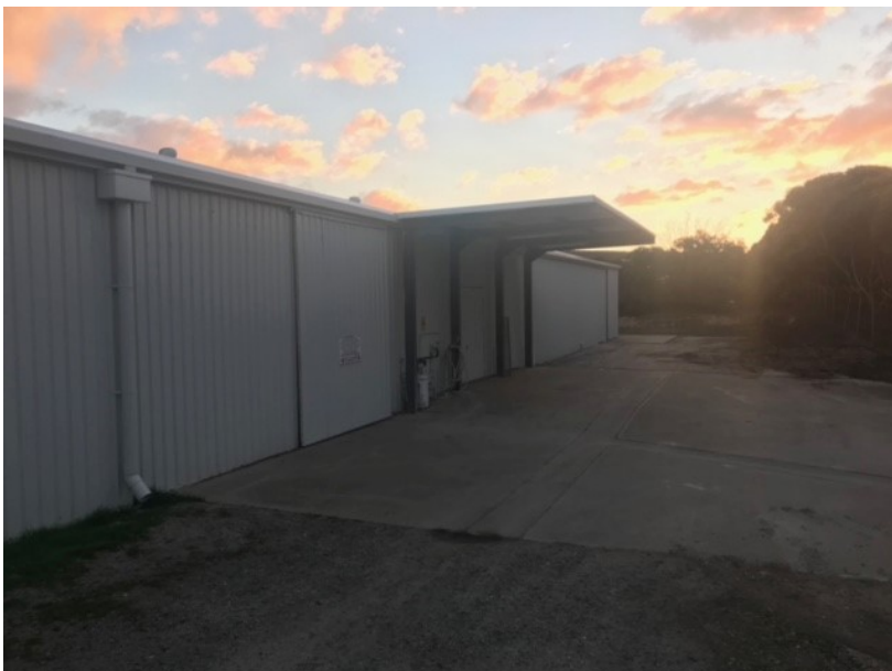
External view of the site