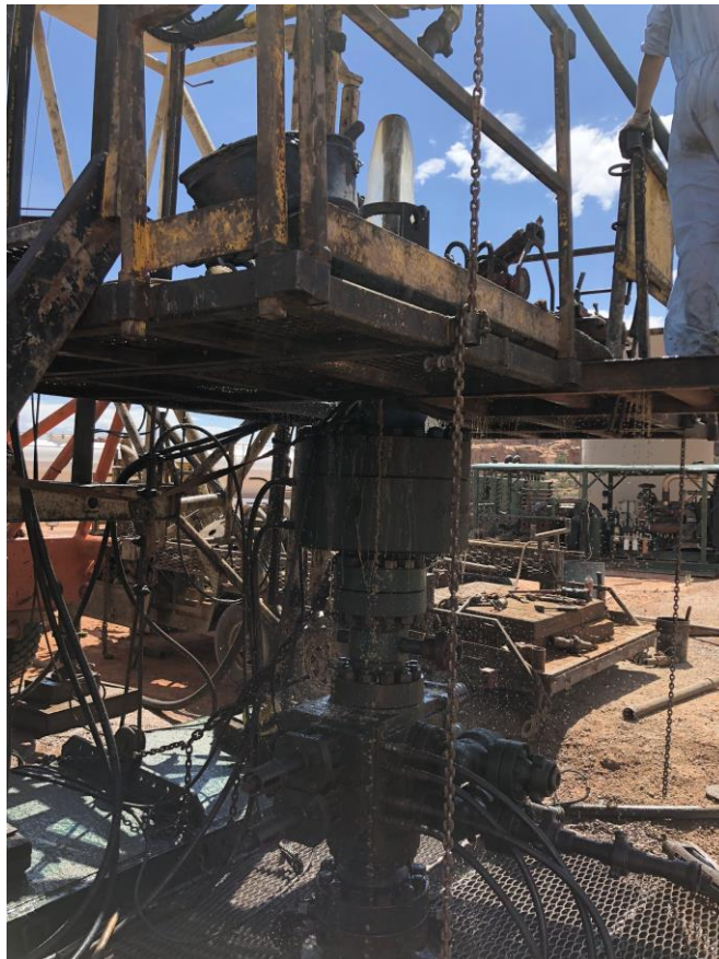
Figure 1: shows the supersaturated brine free flowing from the tubing of the workover rig.

Anson Resources Limited (Anson) is pleased to announce that the supersaturated brine has continued to flow freely from the Cane Creek 32-1 well on re-opening the recently sampled well. The free flowing brine's temperature and pressure is a significant development in relation to the economics of the project moving forward.