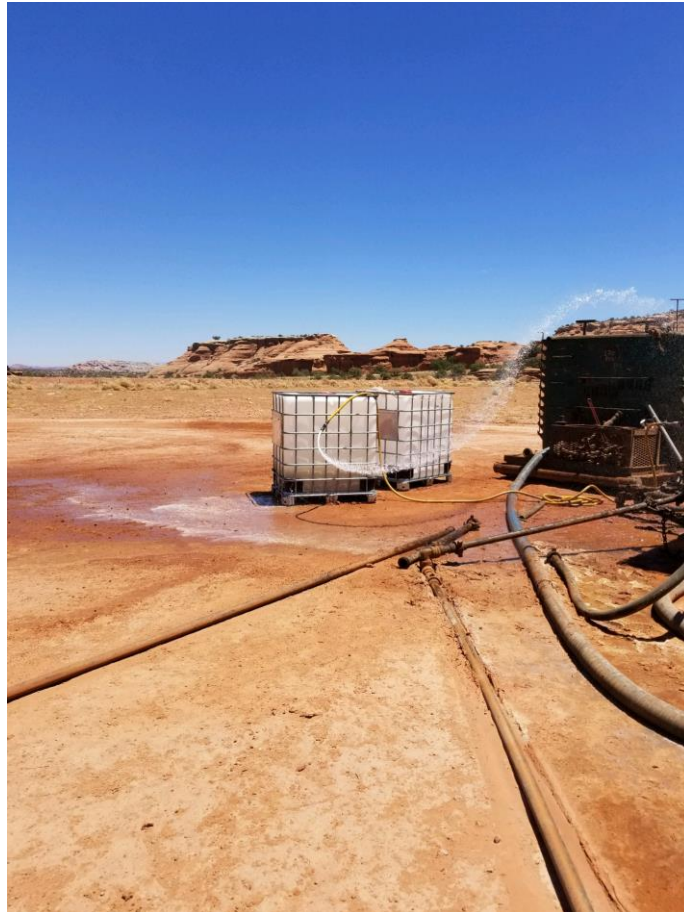
Figure 2: Flow from Cane Creek well showing the extent of the pressure.

The flow rate was measured at 1900 g/h which equates to 45,600 g/d. The flow of the supersaturated brine to surface with this weight from 6,170 feet indicates that there is significant pressure within that clastic horizon and if maintained during production would provide a saving in operating costs.