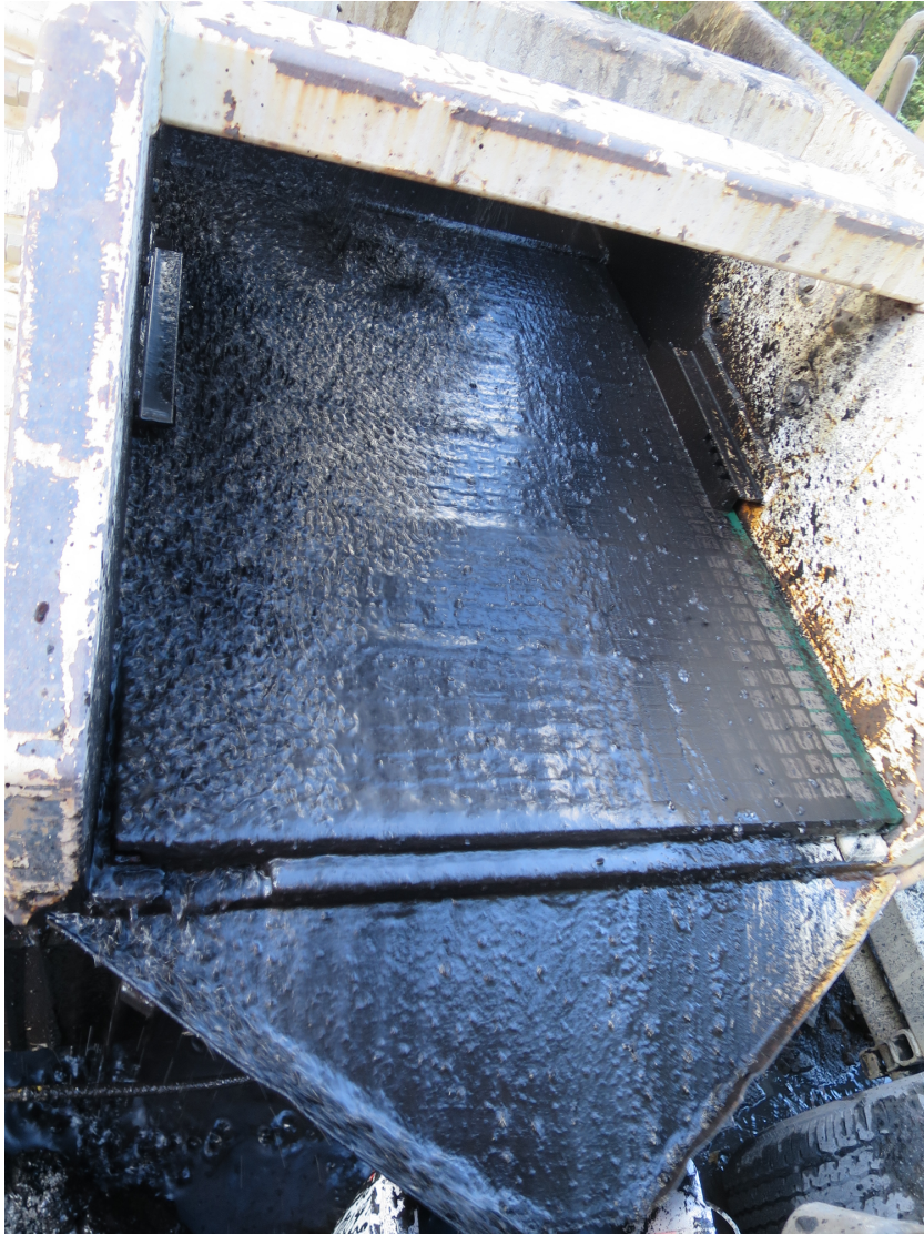
Figure 3 Coal cuttings flowing out of the drill hole during drilling (Photo 26 June 2018)