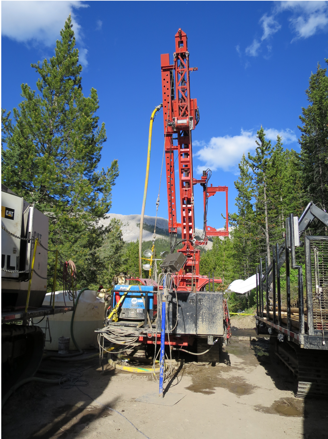
Figure 2 Drilling at Elan South (Photo 26 June 2018)