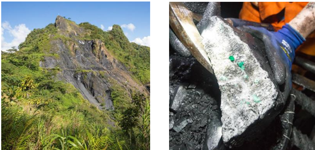
Figure 2. The Coscuez Emerald Mine