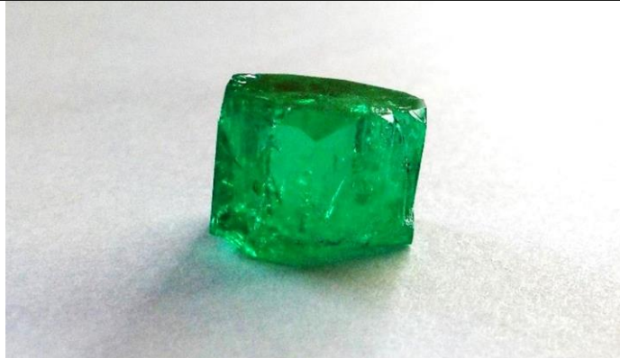
Figure 2a the 25.97carat ARE Emerald

The Coscuez Mine is historically one of the world's most significant emerald mines, having been in operation for over 400 years, and has produced some of Colombia's finest emeralds. Its world-wide recognition stems from the production of renowned pieces like 1,759 carats Guinness Emeralds, believed the one of the largest gem-quality crystal or the pieces found in the Spanish crown, as well as collections from India and the Ottoman Empire, and which continue to be discovered in diverse archaeological findings such as the San Jose galleon.