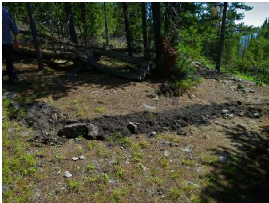
Figure 5. Field surveying at Elan South providing drill targets