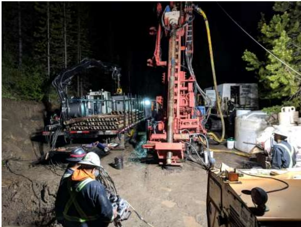
Figure 2 and 3. Drilling at Elan South