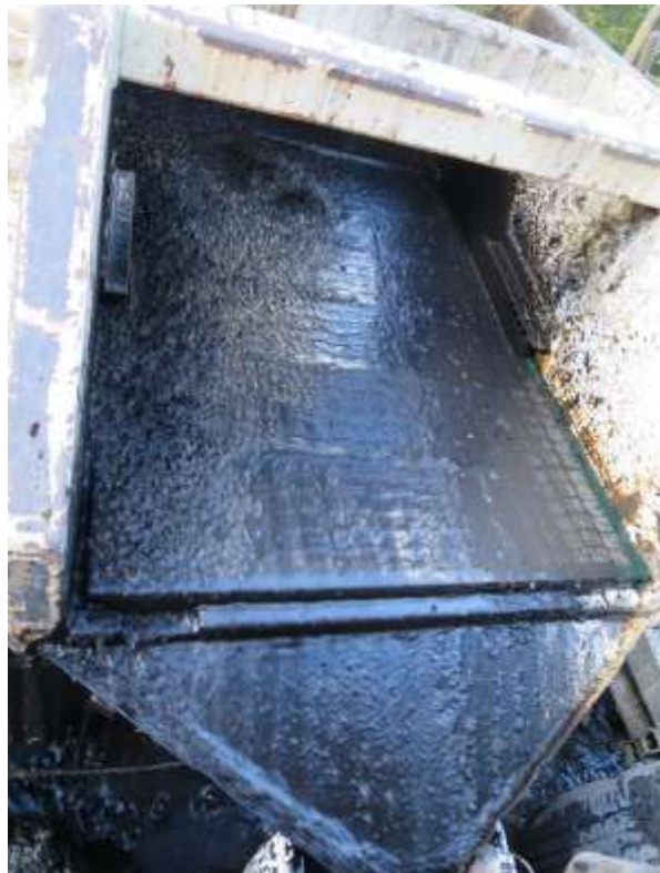
Figure 4. Coal cutting collection during drilling