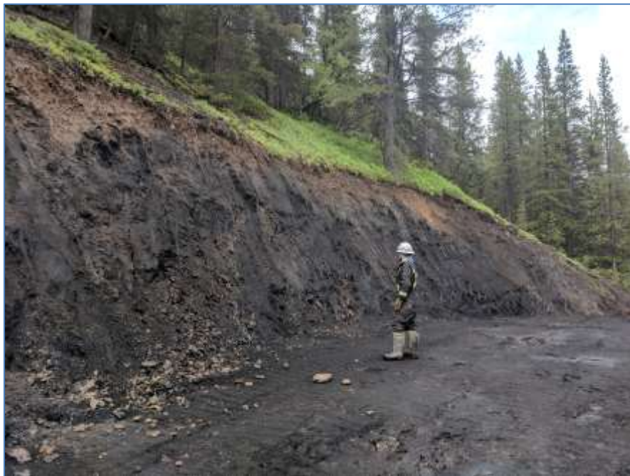
Figure 6 and 7. Road construction at Elan South