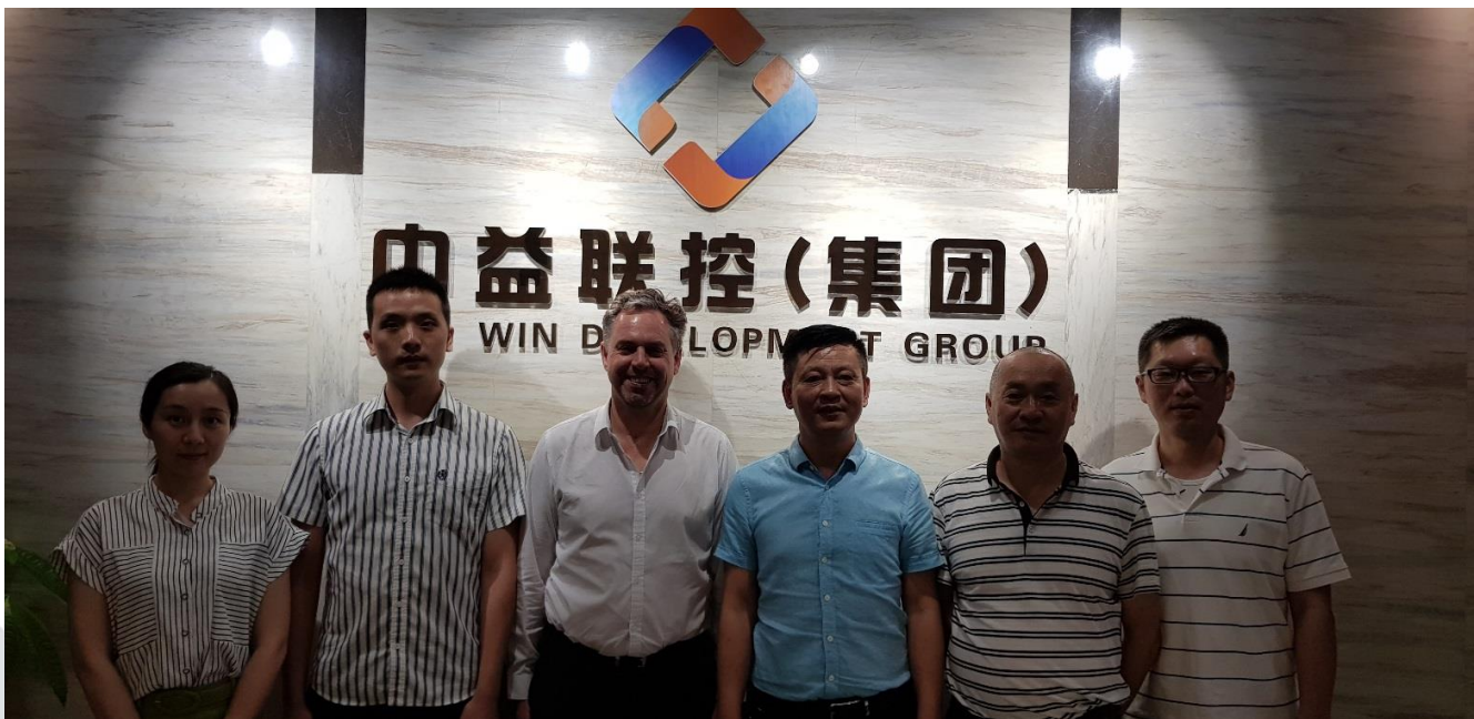
Figure 1 Win-Win Management team with AVL at Win-Win Development Group Head Office in Chengdu

The timing of the Win-Win development and full production has strong synergies with the planned development of the Gabanintha Vanadium Project.