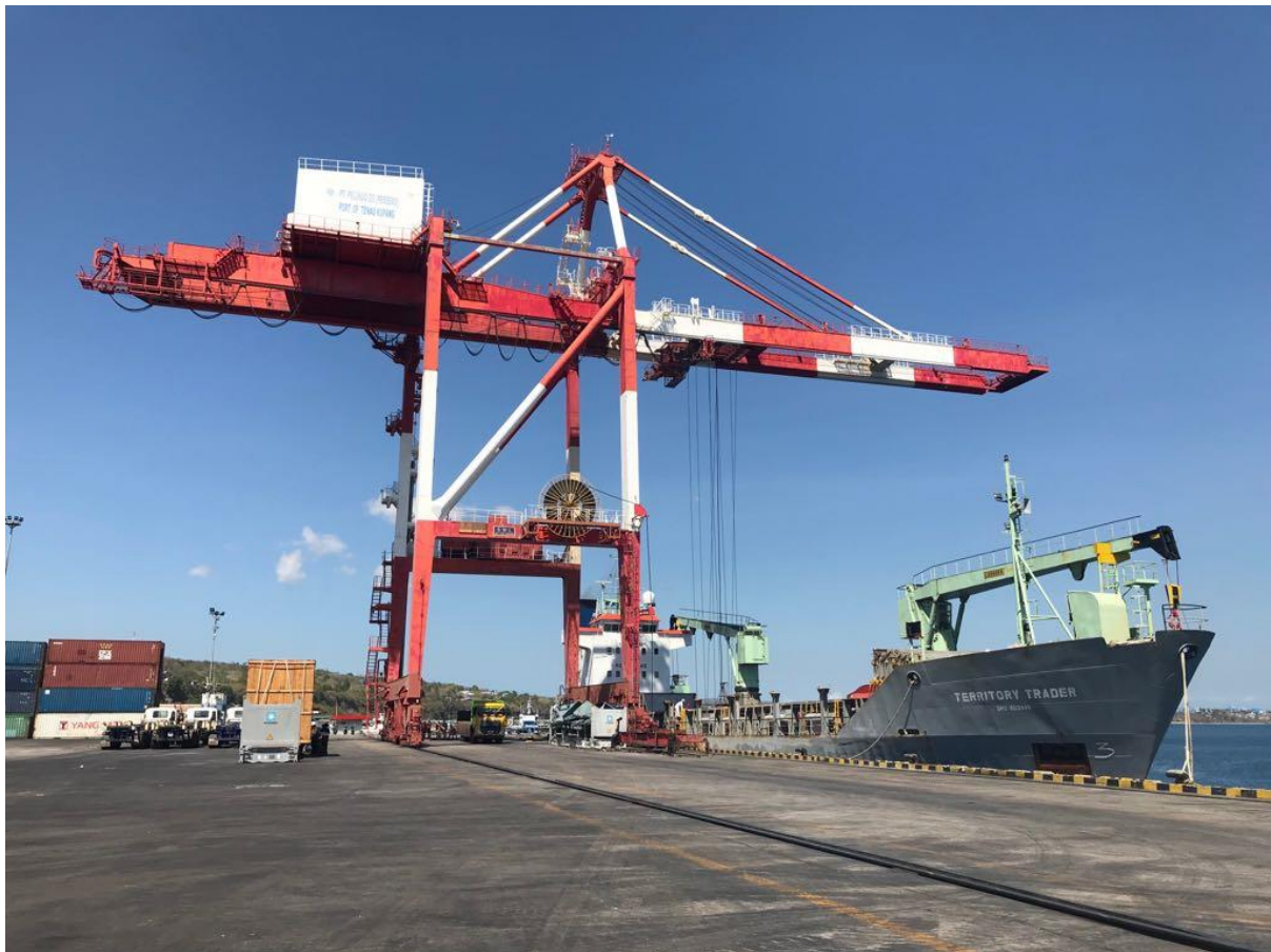
Figure 1: Gulf’s first two smelting furnaces arrived at Tenau Port, Kupang, on board the Territory Trader (pictured)