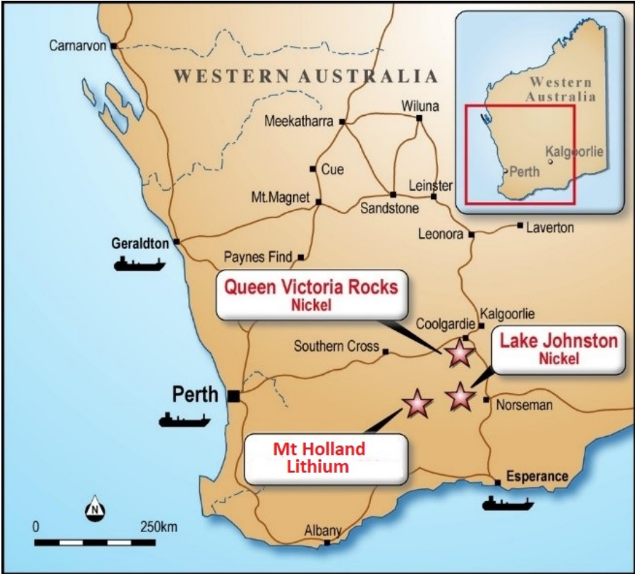
Figure 1: Location Map showing Hannans’ Forresteria Project (adjacent to Mt Holland Lithium) and Queen Victoria Rocks Project and Lake Johnston Joint Venture Project (Hannans free-carried)