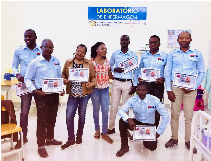
Angolan personnel completed safety and first aid training in July 2018 in Huambo

The survey and gridding of the 100+ planned drill holes in this Phase 1 of the estimated 9,000m drilling programme is complete.