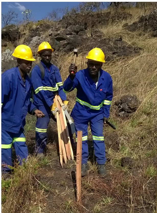
The pegging and survey of proposed drill holes is complete.

The survey and gridding of the 100+ planned drill holes in this Phase 1 of the estimated 9,000m drilling programme is complete.