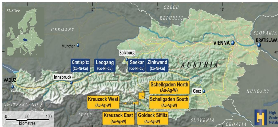
Figure 1. Location of High Grade Metals' Projects within Austria

High Grade Metals (ASX: HGM) is an Australian mineral exploration company with a portfolio of brown fields cobalt, copper and gold assets. The Company's major projects are all located in mining friendly Austria, which covers an area of about 84,000 km 2 across Central Europe. The highly experienced management aims to grow the value of HGM's project portfolio to benefit shareholders by leveraging innovation and maximizing value of the assets through systematic exploration and teamwork. The dynamic two-year exploration and development program underpins the Company's business strategy.