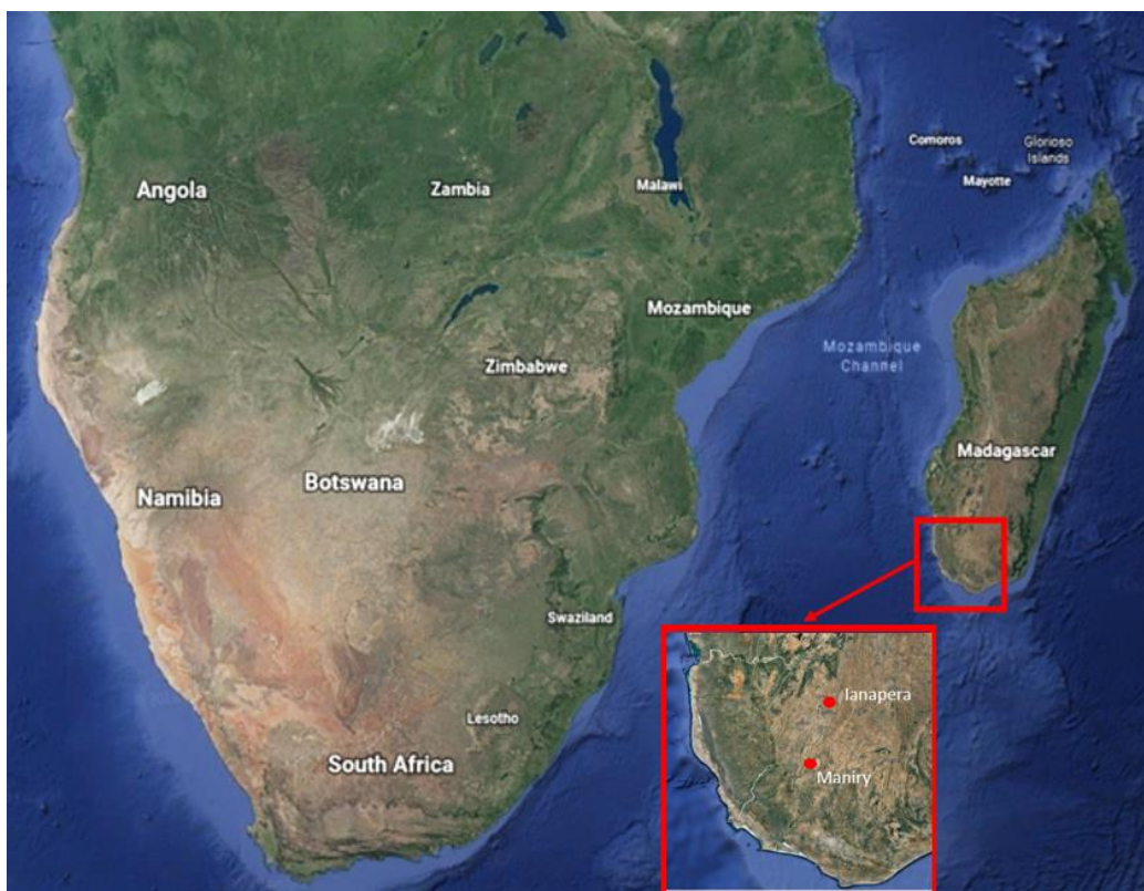
The location of the Company's primary graphite projects: Madagascar (Maniry & Ianapera - above)

BlackEarth Minerals NL (ASX: BEM) ("Company") is an ASX listed company focused primarily on the exploration and development of its 100% owned Madagascan graphite projects.