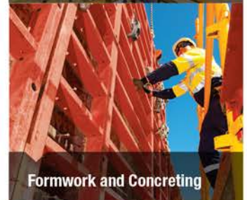
Formwork and Concreting