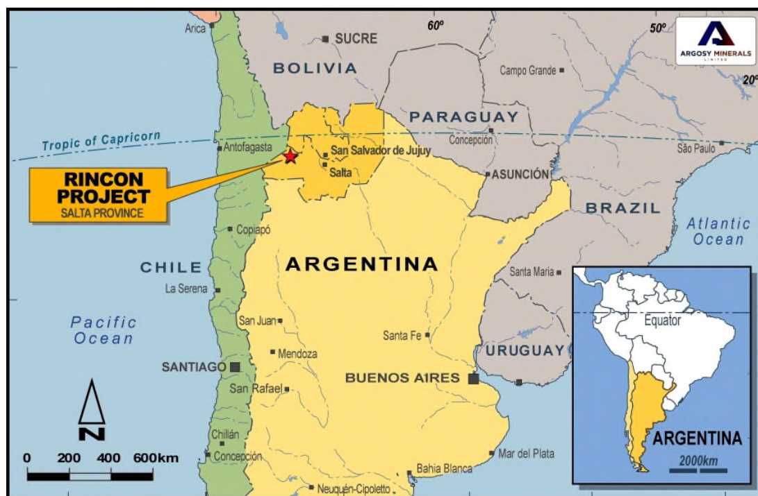
Argosy Minerals Limited – Rincon Lithium Project Location Map