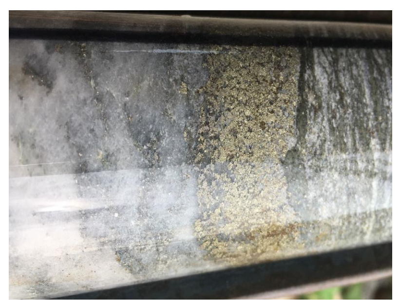
Photo 1: Core showing sericitic alteration, with ASPY and PY in a quartz vein at ANT_004, 159m depth