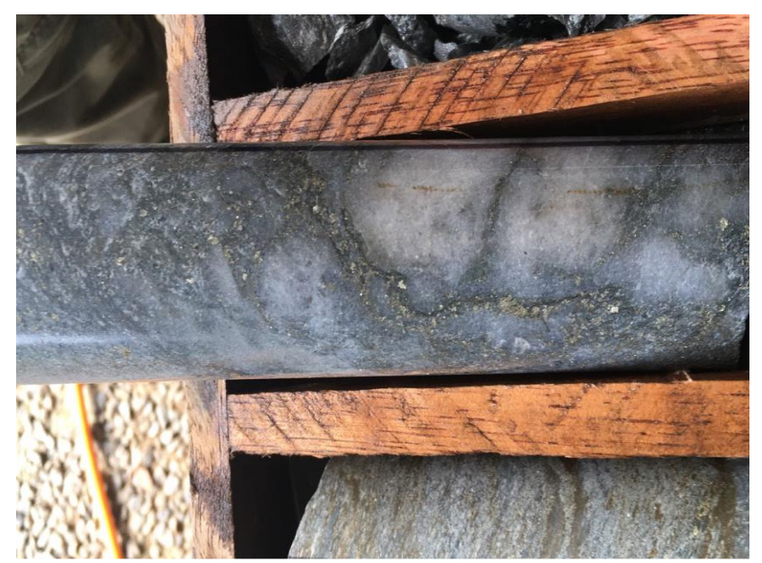
Photo 2: Detail of the sericitic alteration, with ASPY and PY in an intensive silicatated zone at ANT_004, 158m depth