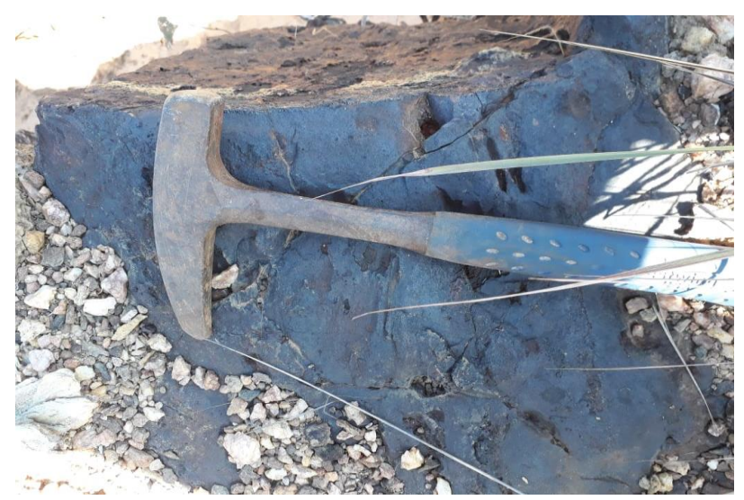
Photo 3: Sample 20768 grading 1.75% cobalt, 0.6% copper and 0.5% nickel