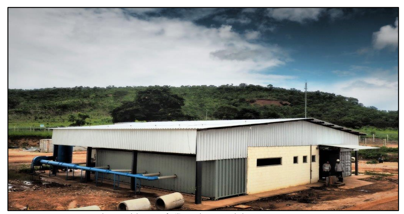
The assay laboratory facility at the Cascavel Plant area.

During 2017, plans were finalised for the construction of an Orinoco owned and managed on-site laboratory, with civil works for the new lab commenced in March 2017 quarter and construction of the laboratory building completed in July 2017. The installation license for the laboratory was received in August 2017 and the lab was completed during September 2017. Additional licenses for the storage and use of cyanide were received during October 2017 and February 2018 and the laboratory was fully operational in March 2018.