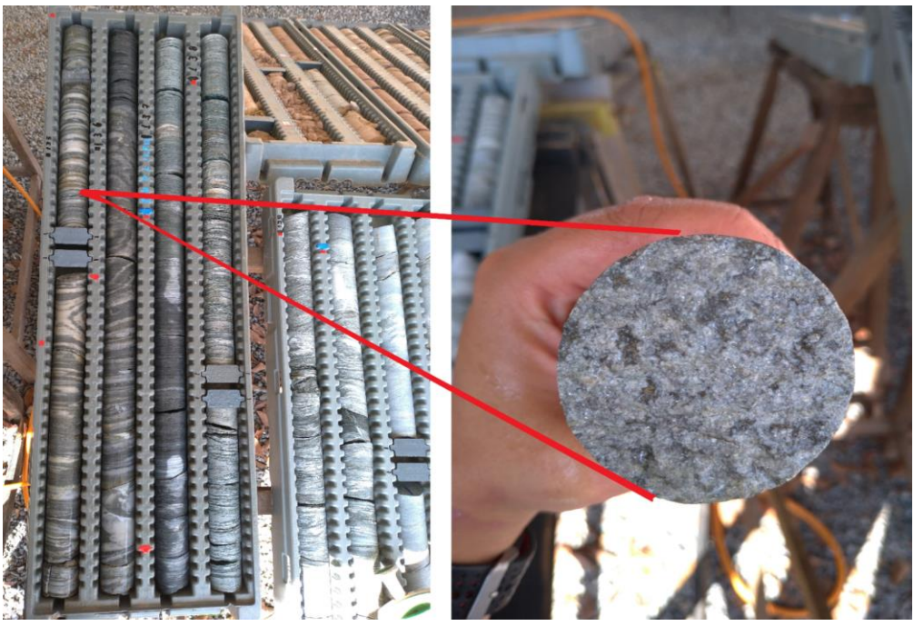
Figure 1 – OST012 Core Samples. Intercept of arsenopyrite at 135m depth.

Following the announcement of a maiden mineral resource estimate in 2017, on 18 July the Company commenced a 12-hole drill programme at Sertão, with the aim of confirming the western and northern extensions of the Sertão Stage 4 and 5 ore body. The first two holes were completed early by August. Historical analysis of historic and current drilling indicates a fault running NE to SW is present along the western extent of the previously mined area of the Sertão Stage 1 and 4 ore bodies and it is believed that the fault has resulted in the dislocation of lateral offsetting of the continuation to the west of the Stage 4 and 5 ore shoots by approximately 25m to the north.