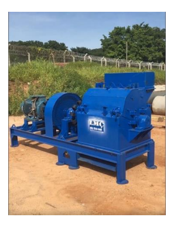
200kg/h Hammer Mill