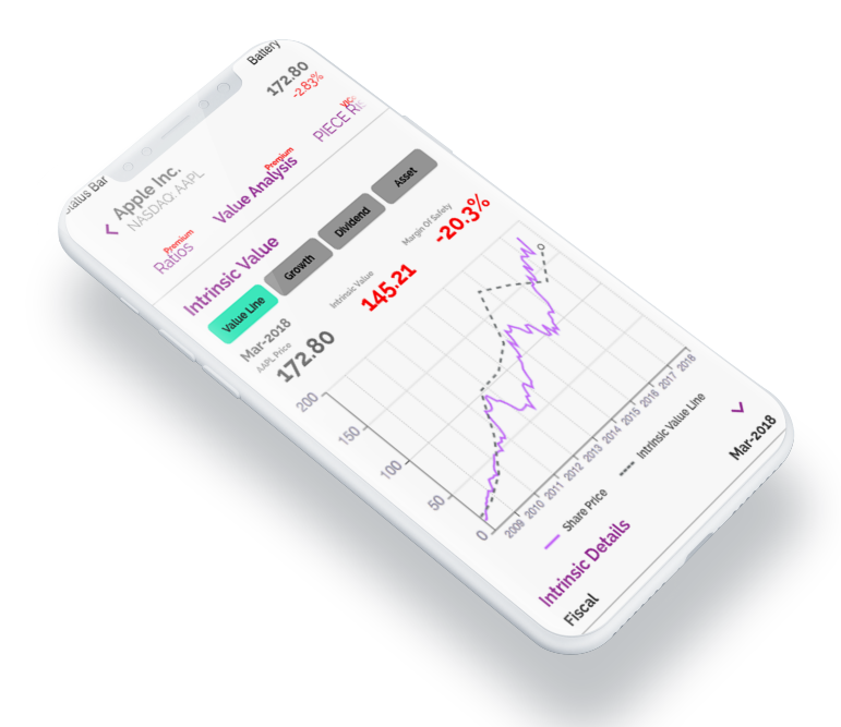
Figure 3. Intrinsic Value tab - Mobile view

With additional developments underway, the Company envisions WealthPark to grow to become the smart Al investing tool and wealth management platform of choice for retail investors, which incorporates 8IH 's proprietary analysis and valuation methodologies and 8VIC's learning materials, to make lifelong learning and stock analysis smarter, faster and easier for the investment community around the world.