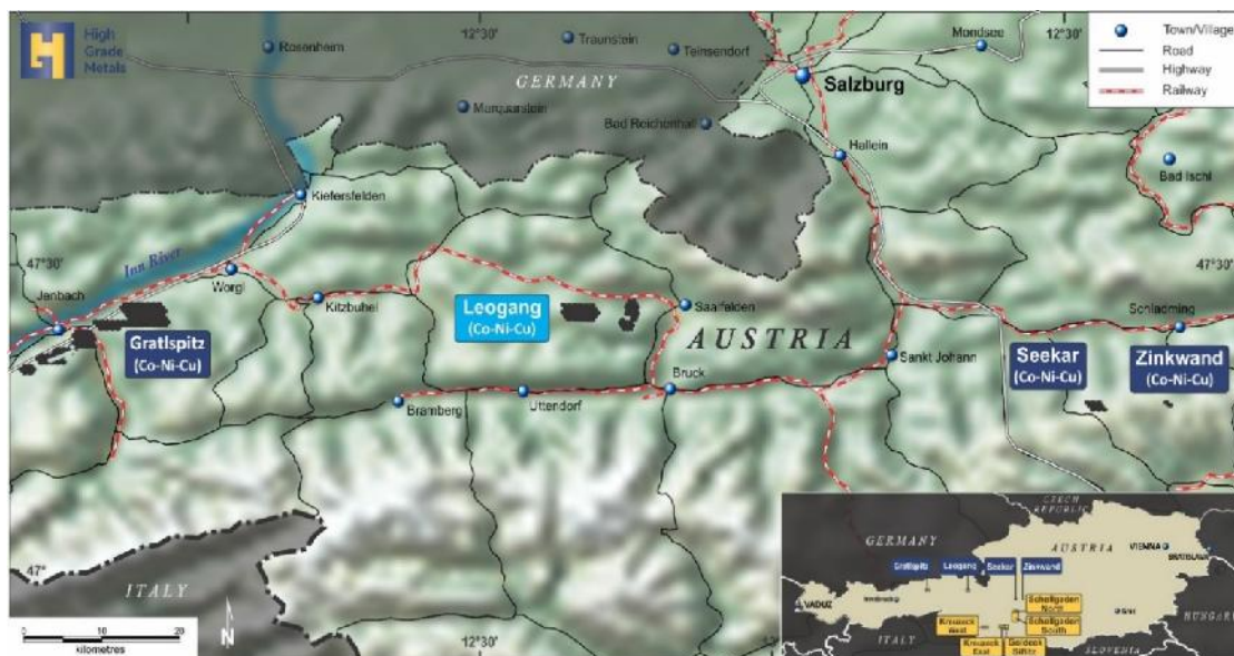
Figure 3 – Location map showing the Company's Cobalt, Copper and Nickel Projects in Austria