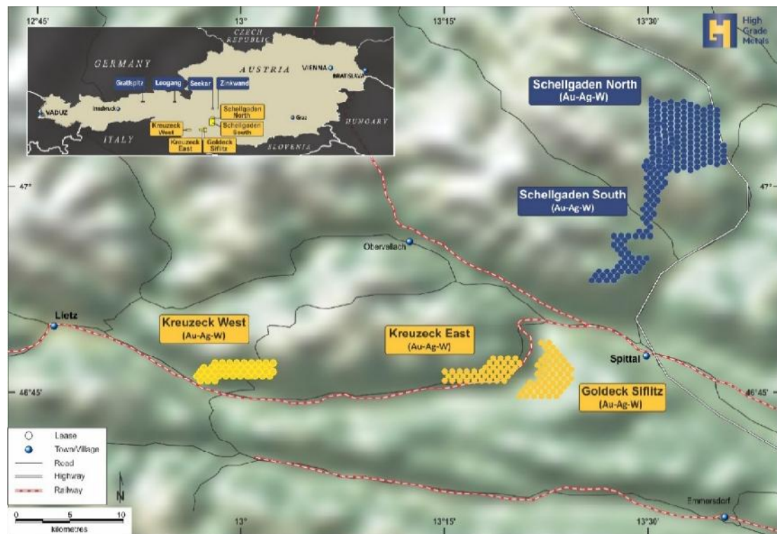
Figure 2: Location map showing the Company's Austrian Gold Projects

The project lies within an exploration area of 44 overlapping Freischürfe covering an area of 23.9km 2 . The projects also sits within the Goldeck-Kreuzek Mining District and includes four significant historical mines; Rabant, Gurskerkammer, Fundkofel, and Knappenstube-Strieden.