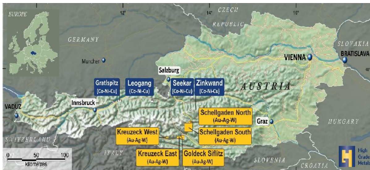
Figure 1: Location map of Austrian Projects