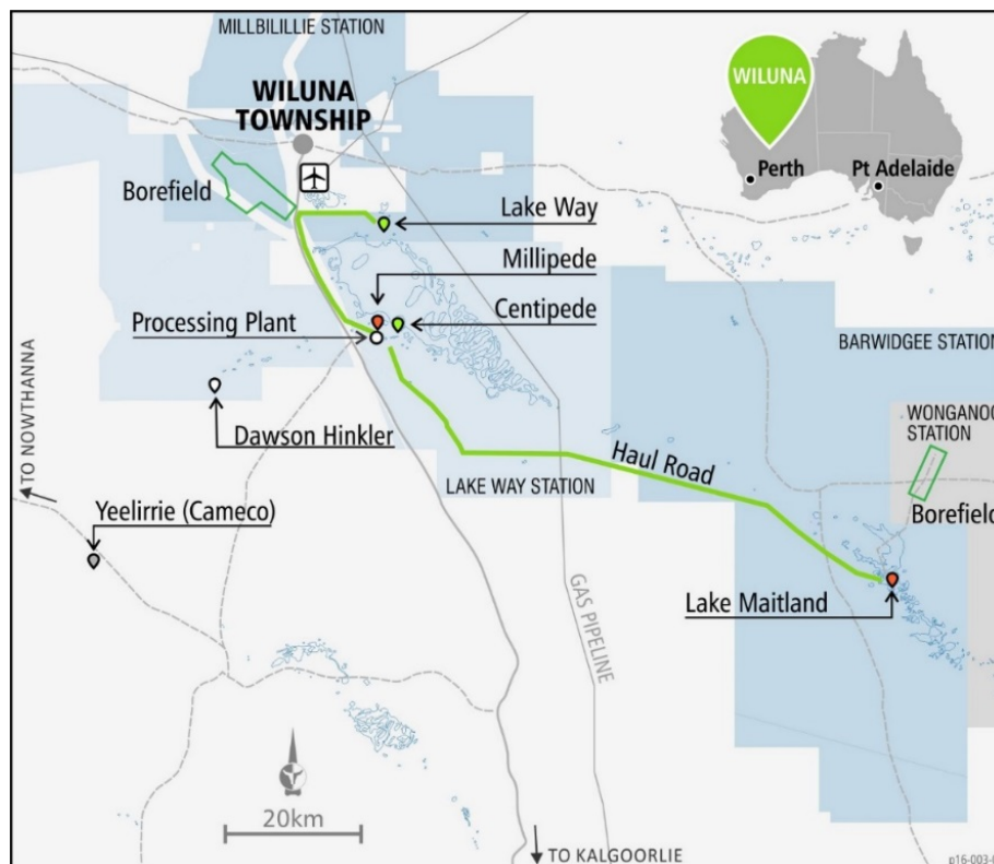
Figure 1 – Location of the Wiluna Uranium Project

The Centipede and Millipede deposits within the Wiluna Uranium Project are located 30 kilometres to the south of the town of Wiluna, which is located 950 kilometres north-east of Perth (refer to Figure 1 ). The major focus of activities during the year was to undertake metallurgical and process design and research initiatives to improve the value of the Wiluna Uranium Project. All work streams are geared to ensure the Wiluna Uranium Project is capable of being financed and brought into production as and when economic conditions justify the development.