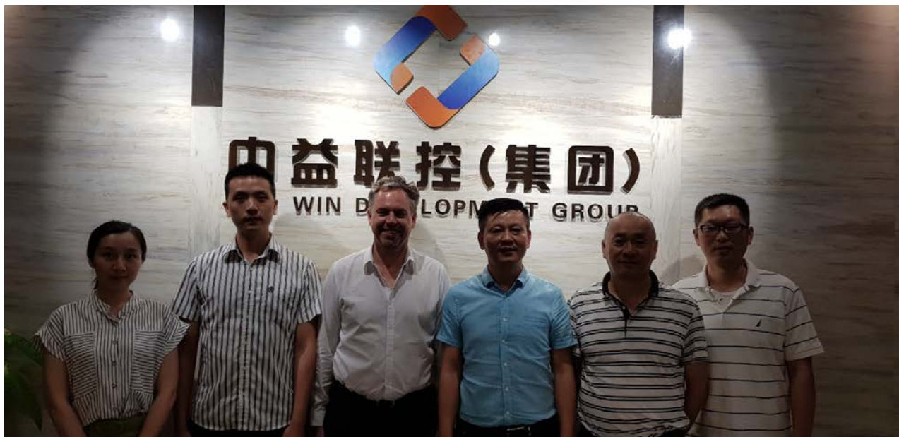
Figure 2 Win-Win Management team with AVL at Win-Win Development Group Head Office in Chengdu

The Company announced in June 2018 that it had signed a Memorandum of Understanding (MOU) with Chengdu based, Chinese steel and alloy product company Win-Win Development Group. The agreement provides an understanding between the two companies to further discussions around project finance and purchase of vanadium for steel strengthening. Win-Win is currently building a 5,000 tonnes per annum (tpa) vanadium carbon nitride (VCN) production line which requires approximately 7,000-8,000tpa of 98% V_2O_5 . The first stage will require 2,000-3,000tpa and be operational in 2019 and the second stage is planned for the following year. Win-Win has a shareholding in an operating production line currently producing 2,400tpa of VCN products for existing steel companies.