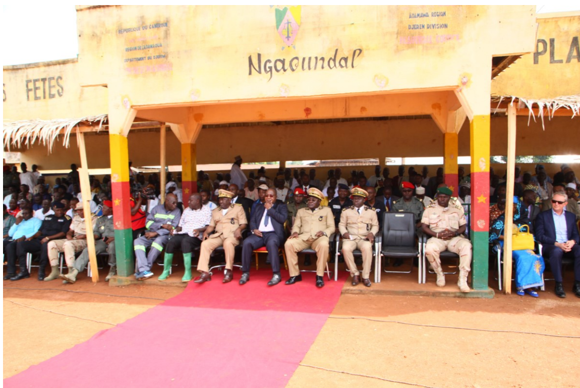
Figure 1: The official delegation for the launch ceremony in the town of Ngaoundal

A series of major media and community launch events were held on Monday 17 September in the towns of Ngaoundal, Minim and Martap to celebrate the commencement of works on the Project by Camalco SA, Canyon's wholly owned subsidiary company in Cameroon. The town of Ngaoundal is located adjacent to the bauxite plateaux within the Ngaoundal permit. Both the villages of Minim and Martap are located next to bauxite plateaux within the Minim Martap permit.