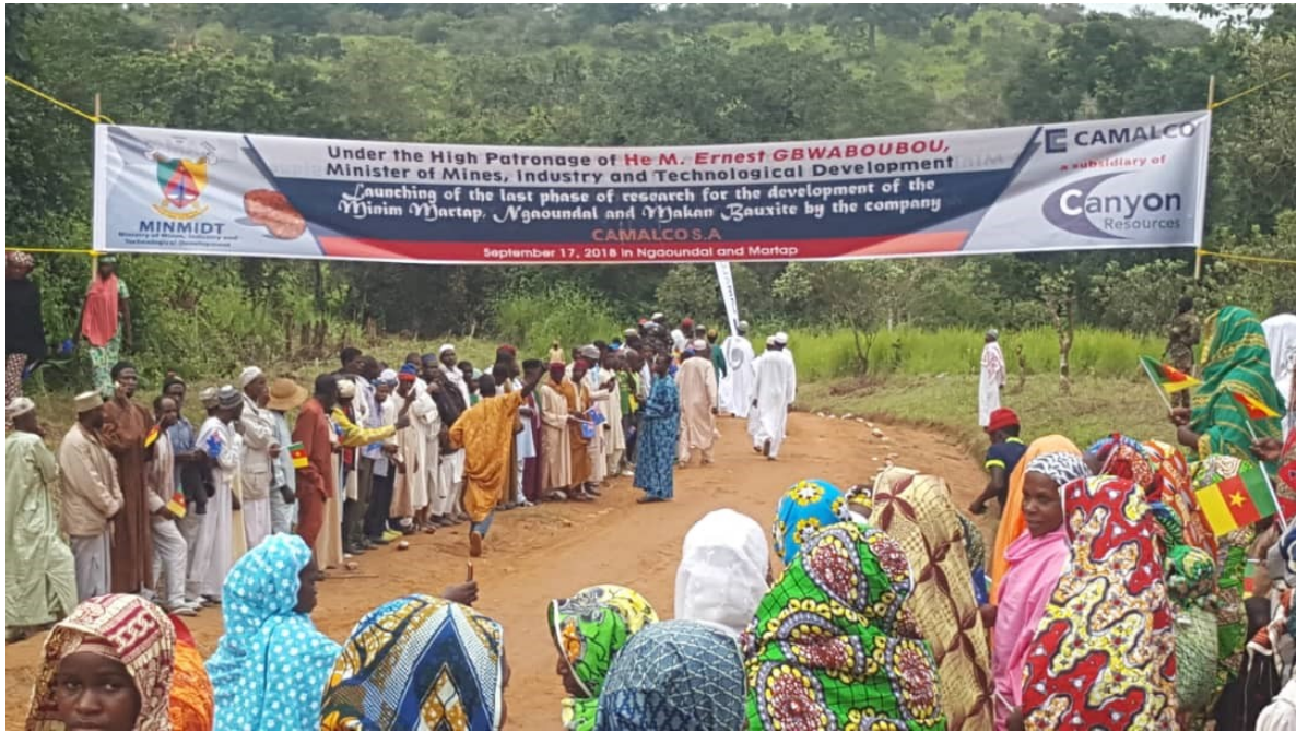
Figure 2: A welcome banner and villagers at the village of Minim

A delegation of Board and management representatives from Canyon Resources, and local senior management from Camalco SA, along with a delegation from the Ministry of Mines, Industry and Technological Development, including His Excellency The Minister of Mines Ernest Gwabouboou and the Governor of the Adamawa Region M. Kildaldi Taguieke Bukar and other local dignitaries, attended the events that were each highlighted by a traditional welcome by the local villagers and speeches from His Excellency, The Minister of Mines and from Canyon Resources Ltd.