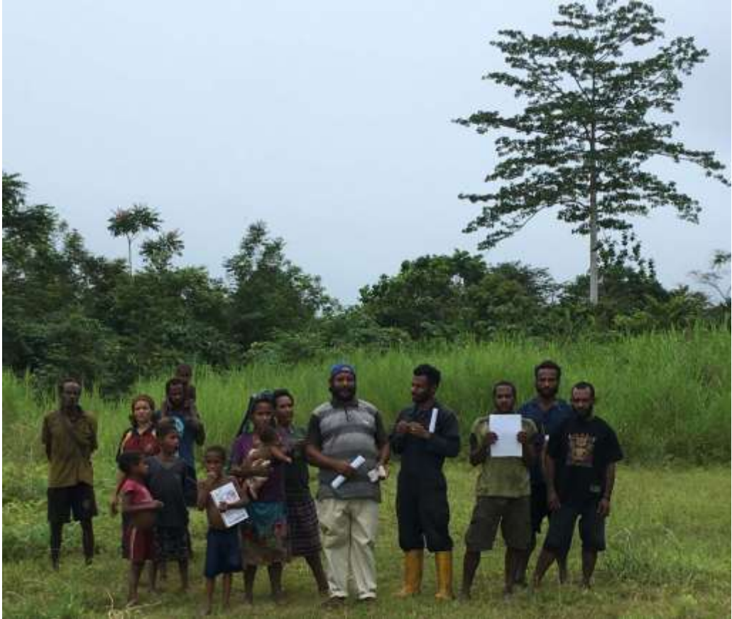
Figure 3: Landowners at Tobi Village during Wardens Hearing for EL2356 Renewal