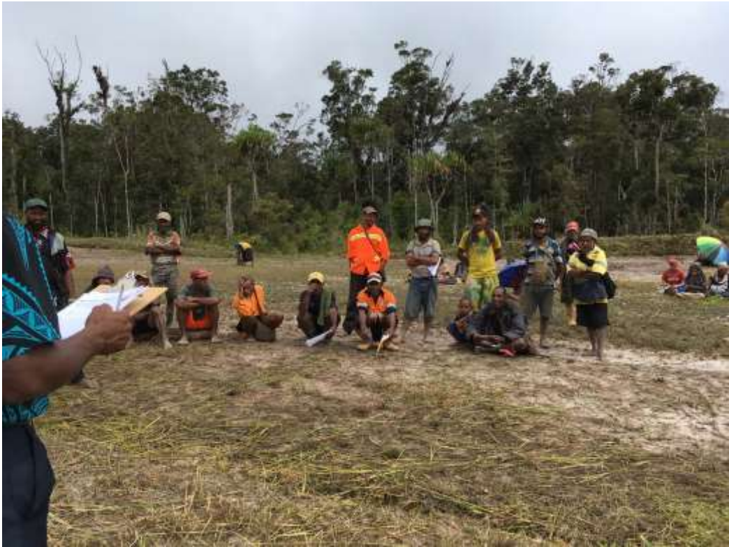
Figure 2: Yambo Airstrip Wardens Hearing for EL 1595 Renewal

The MRA mining warden was pleased with the conduct of the landowner meetings and had no unfavourable issues to report.