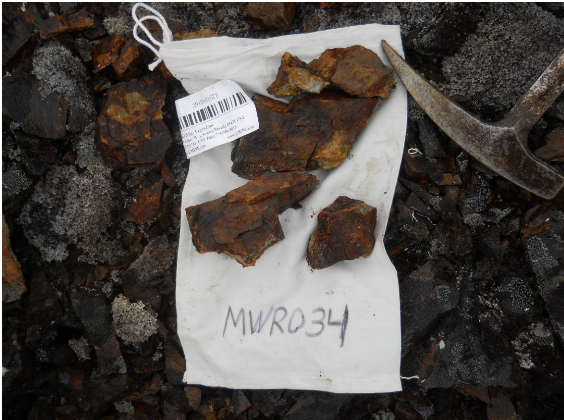
Figure 4. Oxidised and mineralised quartz vein (MWR034 11.65g/t Au).