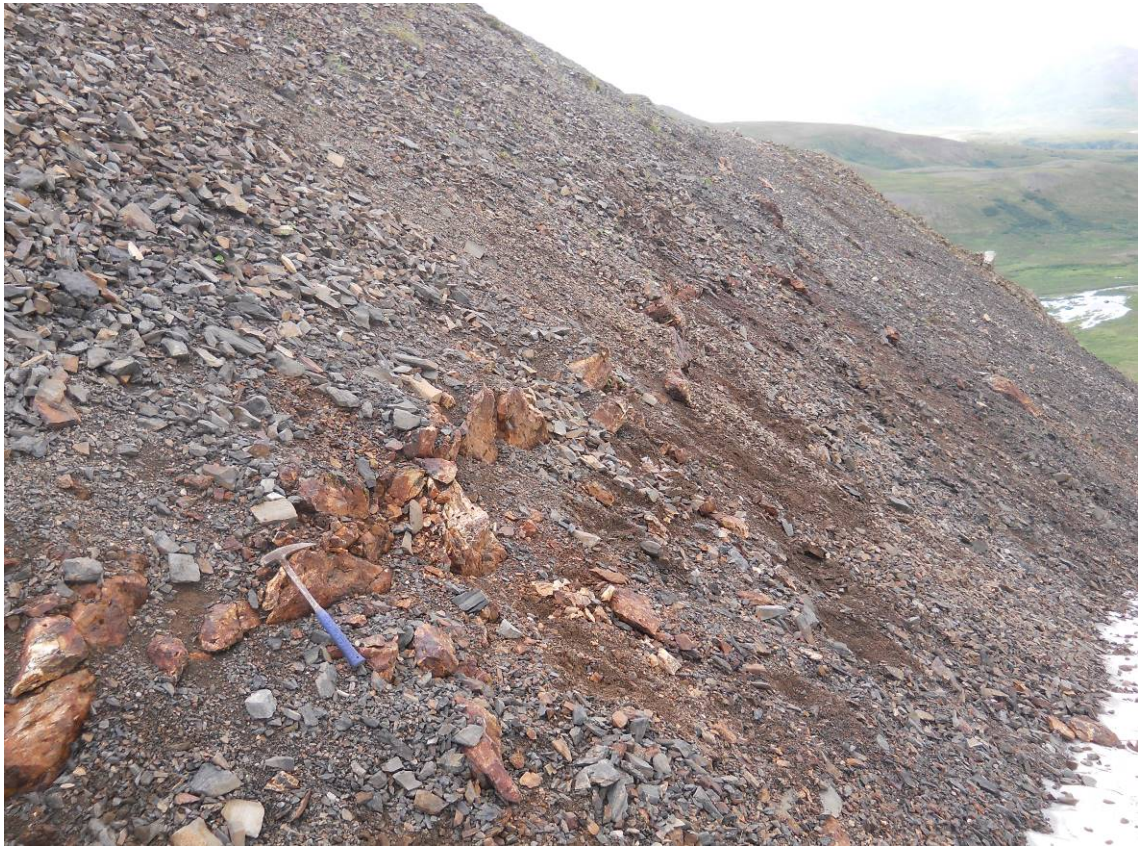
Figure 3. Outcropping epithermal quartz vein ( MWR021 6.43g/t Au).