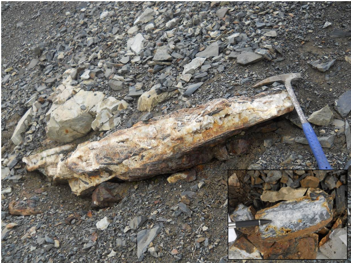
Figure 2. Outcropping epithermal quartz vein with sample MWR018 (6.71g/t Au, inset).