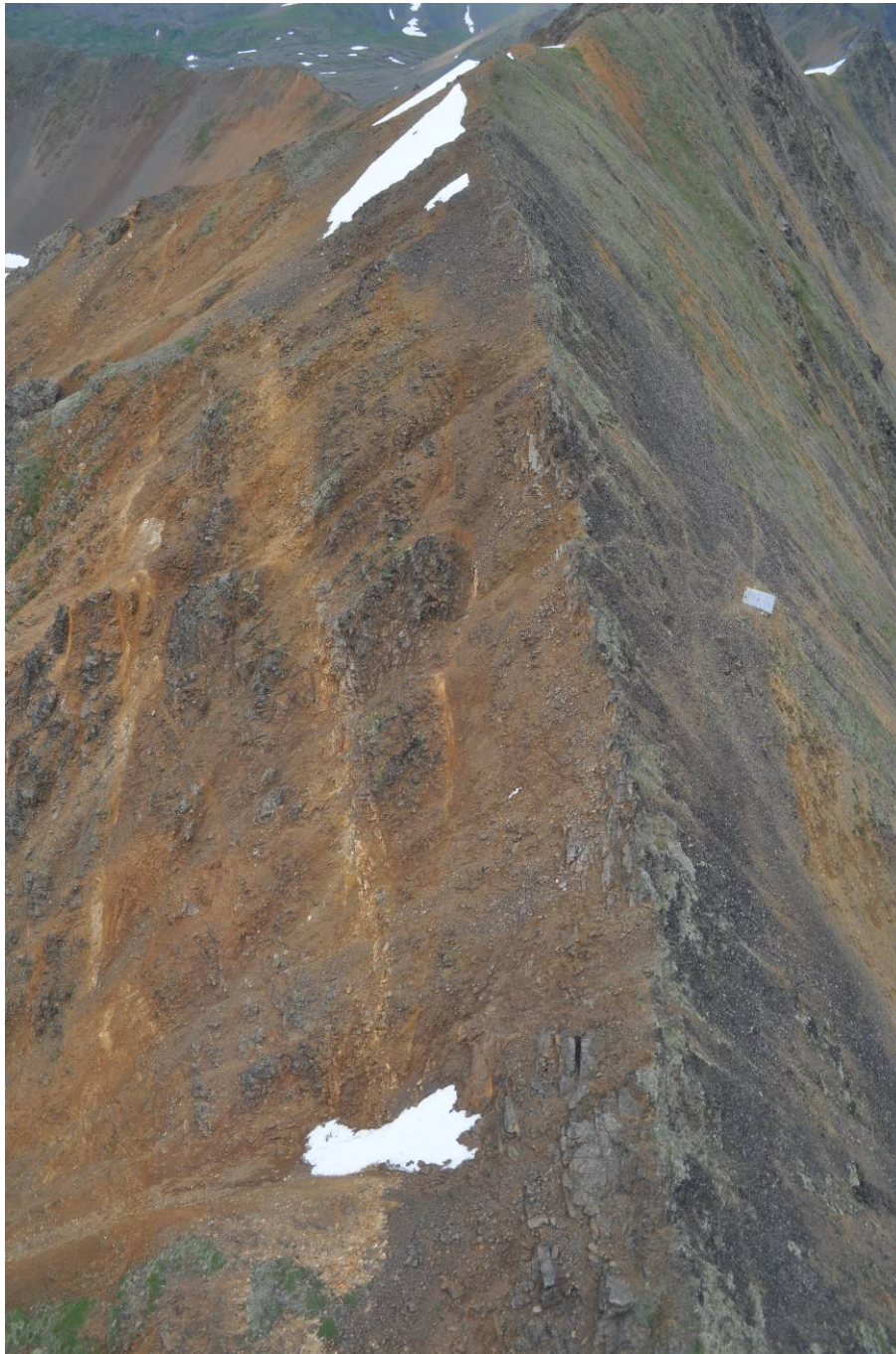
Figure 5. Golden Dyke target showing existing drill platform in relation to outcropping mineralised dykes.