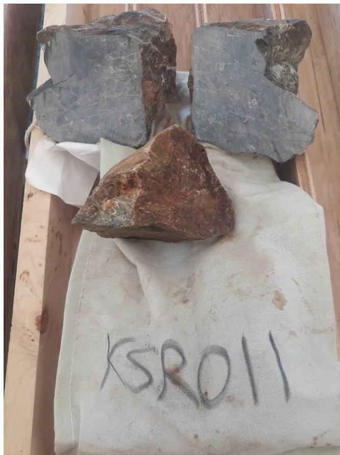
Figure 4. Hydrothermal breccia (KSR011 - 12.15g/t Au, As >10,000ppm, 554ppm Sb).