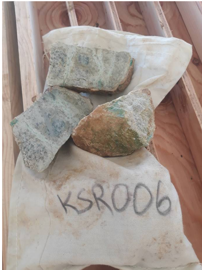
Figure 3. Disseminated sulphides and oxide copper mineralisation within felsic porphyry (KSR006 - 3.35g/t Au, As>10,000ppm, 0.33% Cu).