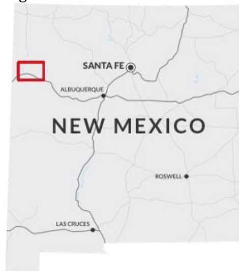
Figure 2: Laramide Resources Ltd. Projects area in New Mexico, USA.