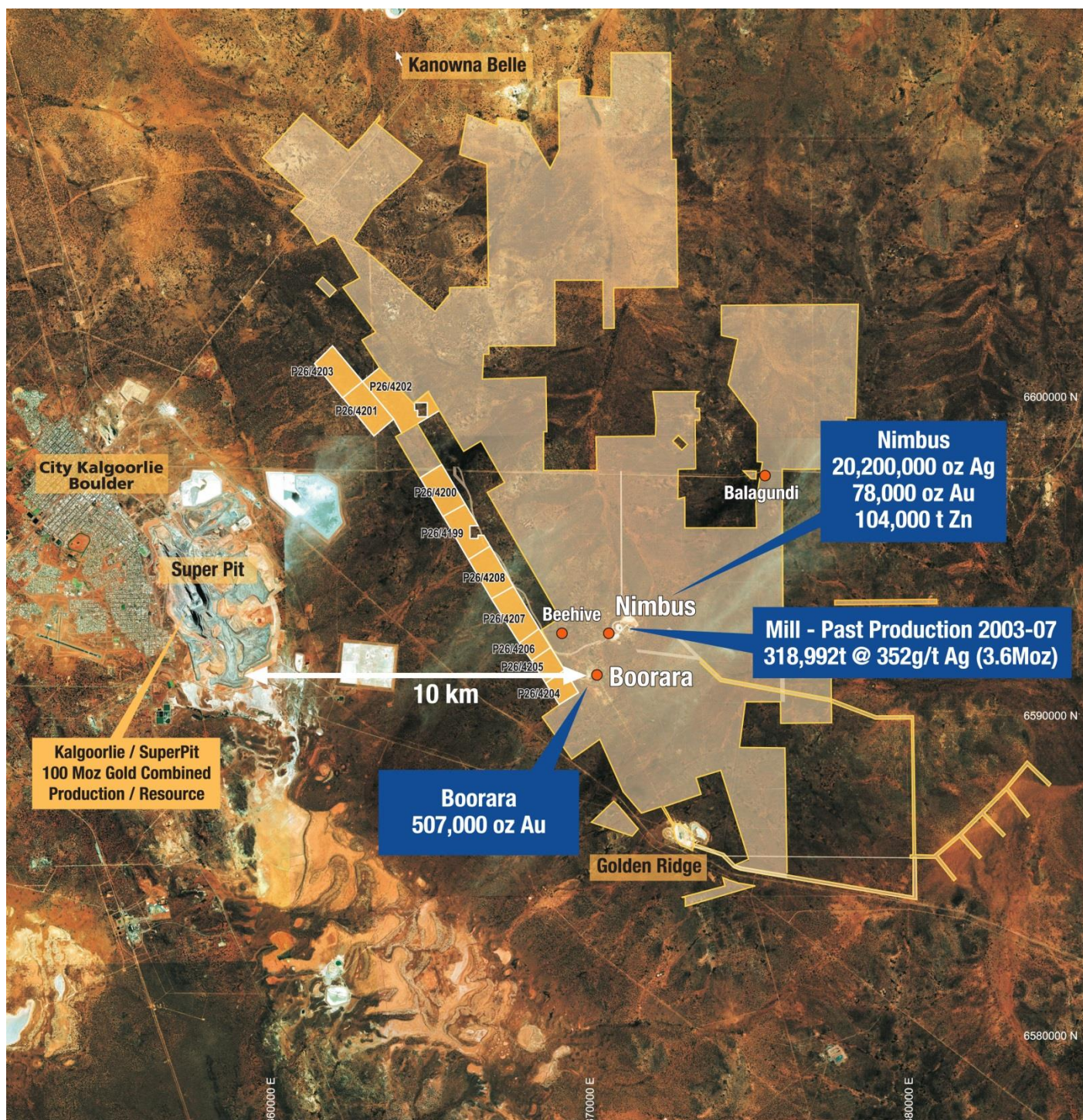
Figure 1: MacPhersons Resource Tenement Plan with new applications.