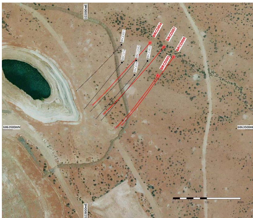
Figure 2: Completed (Sept 2018) RC/Diamond Drill Hole Location Plan

Jamie Sullivan Executive Director 12 October 2018