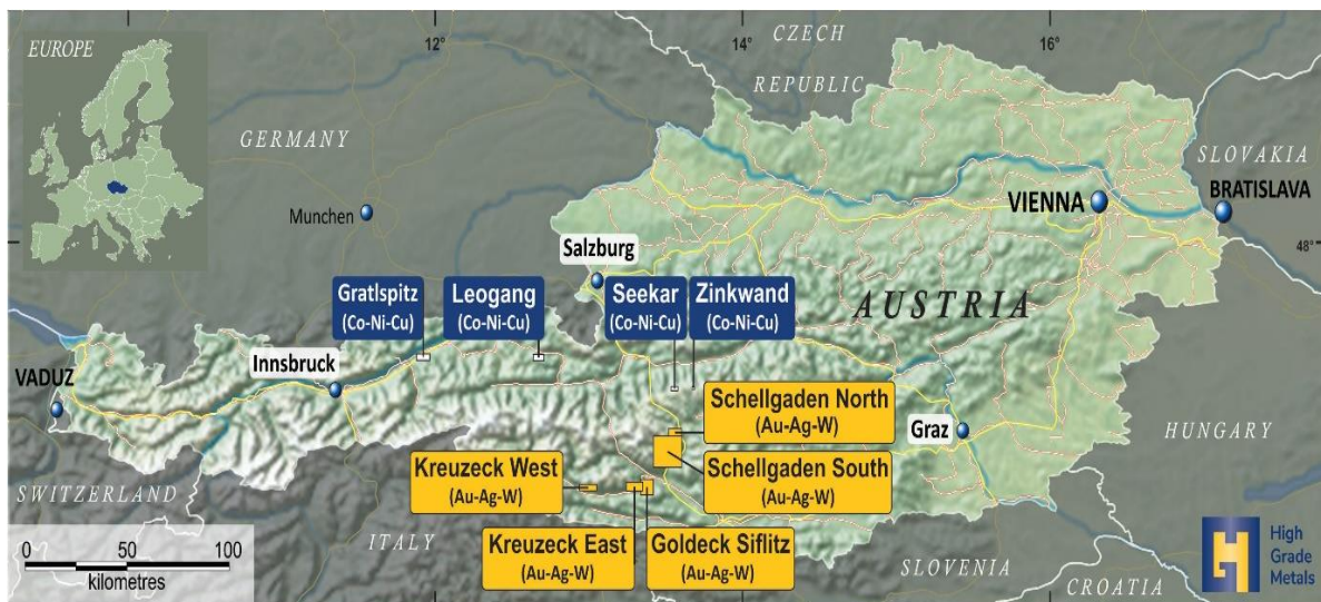
Figure 1. Location of High Grade Metals' Projects within Austria

High Grade Metals (ASX: HGM) is an Australian mineral exploration company with a portfolio of brown fields cobalt, copper and gold assets. The Company's major projects are all located in mining friendly Austria, which covers an area of about 84,000 km 2 across Central Europe. The highly experienced management aims to grow the value of HGM's project portfolio to benefit shareholders by leveraging innovation and maximizing value of the assets through systematic exploration and teamwork. The dynamic two-year exploration and development program underpins the Company's business strategy.