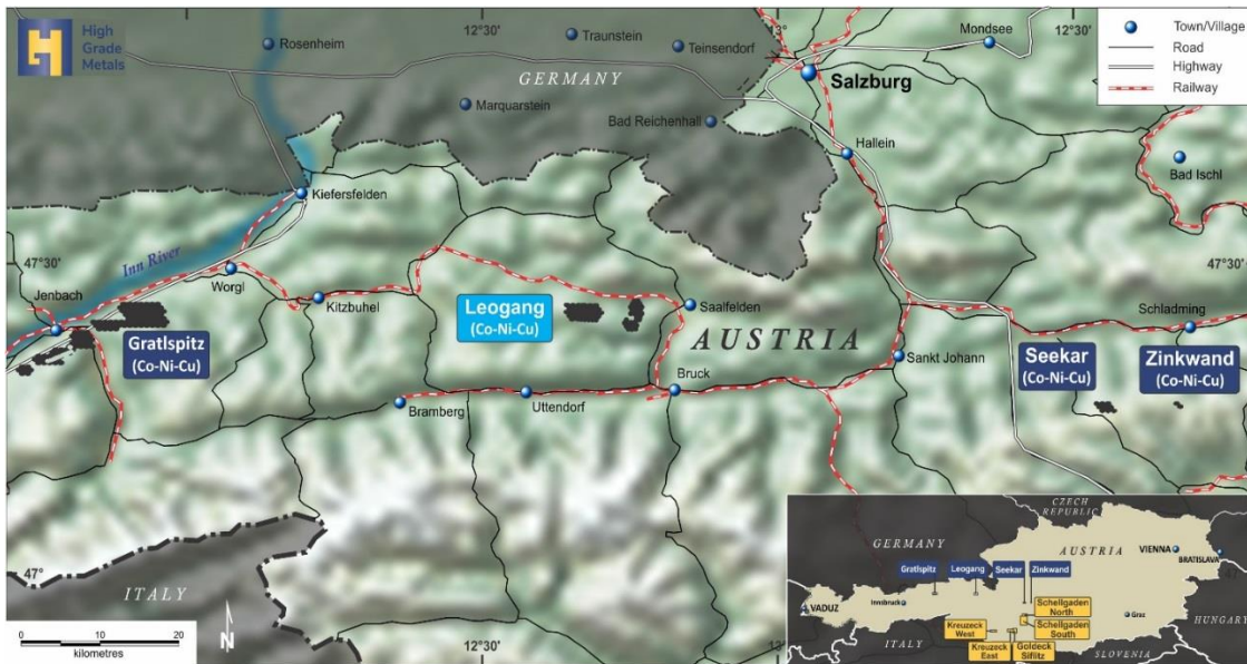
Figure 3 – Location map showing the Company’s Cobalt, Copper and Nickel Projects in Austria

The project lies within an exploration area of 2 overlapping Freischürfe covering an area of approximately 1km 2 . The project covers the site of historic sulphide mining including both cobalt and nickel. Several historical mining adits are still accessible within the project area.