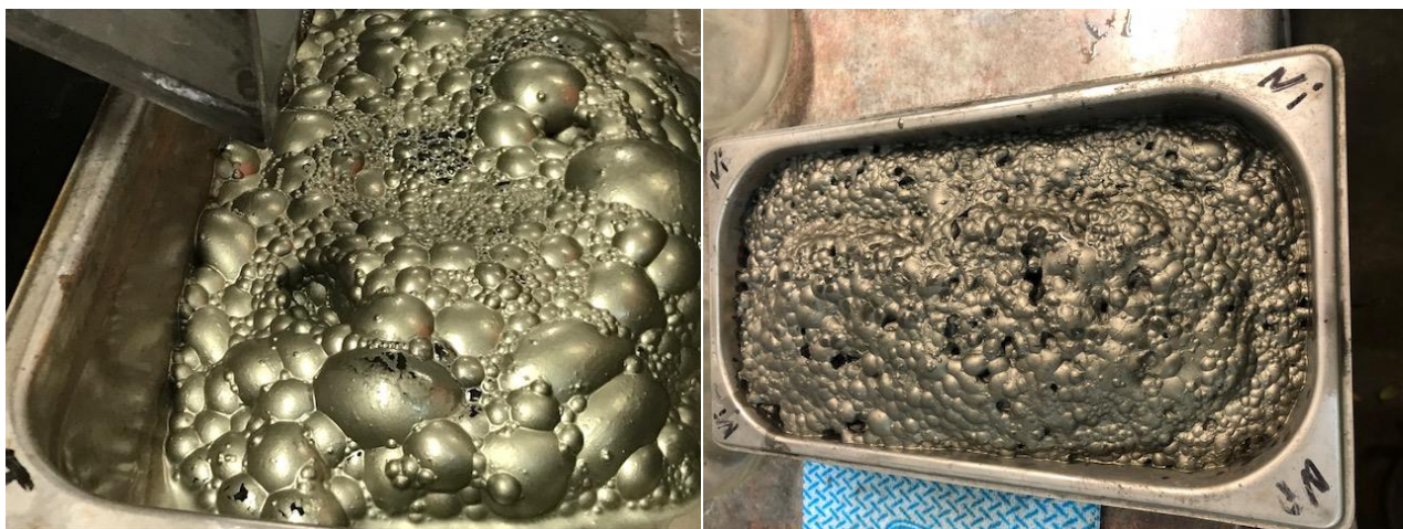
Figure 3. Final copper concentrate (left) and nickel concentrate (right) from Master Composites

A weighted average (based on the master composite relationship to the mine plan) of the test results for each master composite will be used as the basis to the process design criteria for recovery, grade, residence time, reagent addition and the basis of the flowsheet. Further testwork is continuing to refine the optimum conditions. In addition, over 40 samples have also been submitted for comminution testwork to test the mechanical properties of the potential ore types. Data collected from this testwork will be used to guide process plant design and engineering.