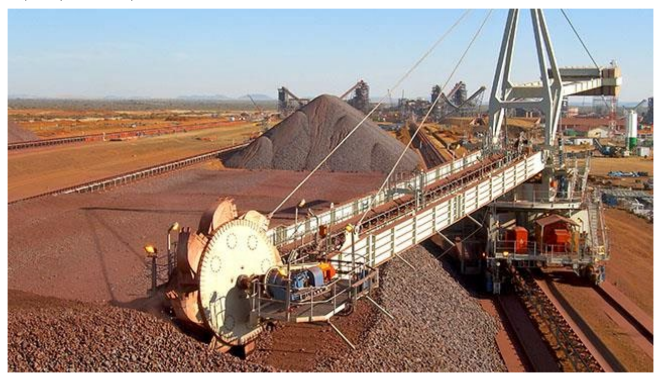
Typical Sandvik 12,000 tph bucket-wheel reclaimer

There are 12 buckets on the wheel for the machine these buckets are destined for, each with a capacity is 2.2 m<sup>3</sup>. The reclaimer has a nominal machine capacity is 12,000 tph and maximum capacity is 14,500 tph in bauxite.