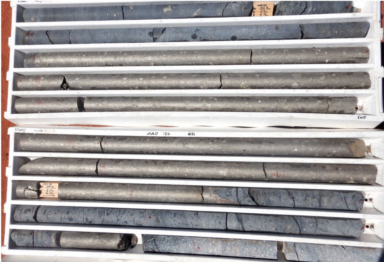
Figure 2 – drill core tray from MAD126 with 5.25m of massive sulphides from 185m to 190.25m with preliminary XRF readings of 8.8%Ni and 4.5%Cu.

DHEM surveys are scheduled for the abovementioned drill holes once MAD127 is completed.