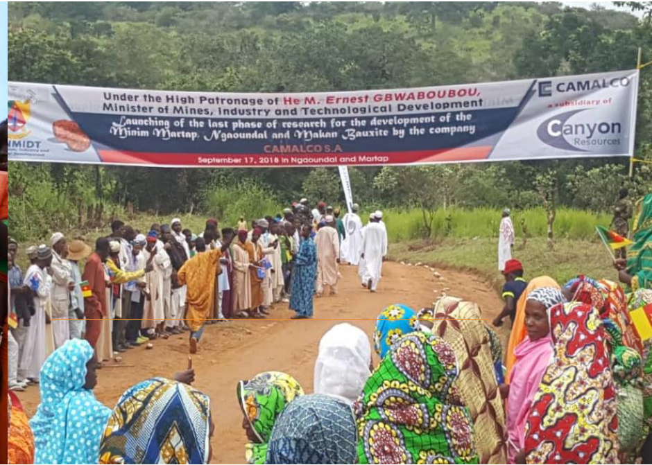
Consultation and initial ESIA engagement with the local communities underway to ensure positive relations with residents and authorities.