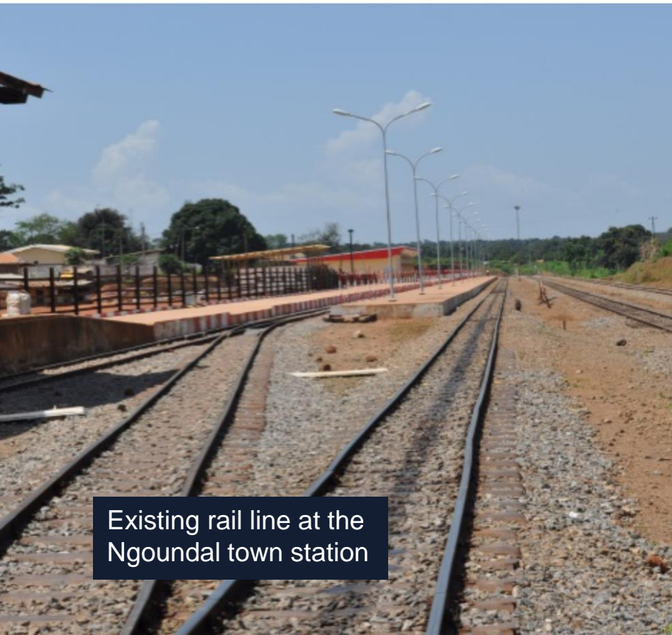
Existing rail line at the Ngoundal town station