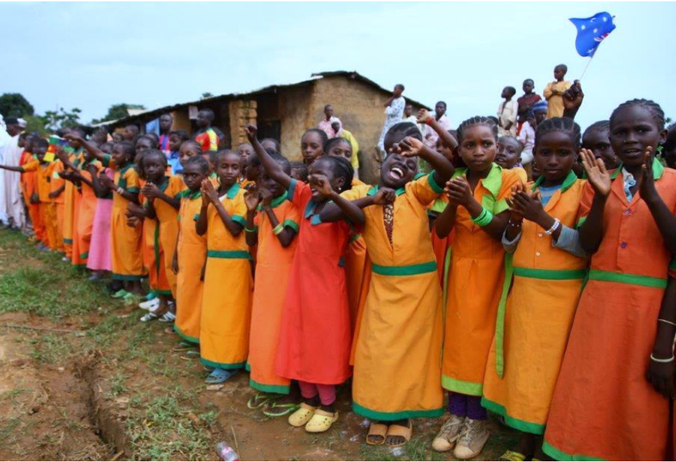
Canyon hosted events with Cameroon's Minister of Mines, Adamawa Region Governor and local dignitaries in three towns close to Minim Martap in September 2018