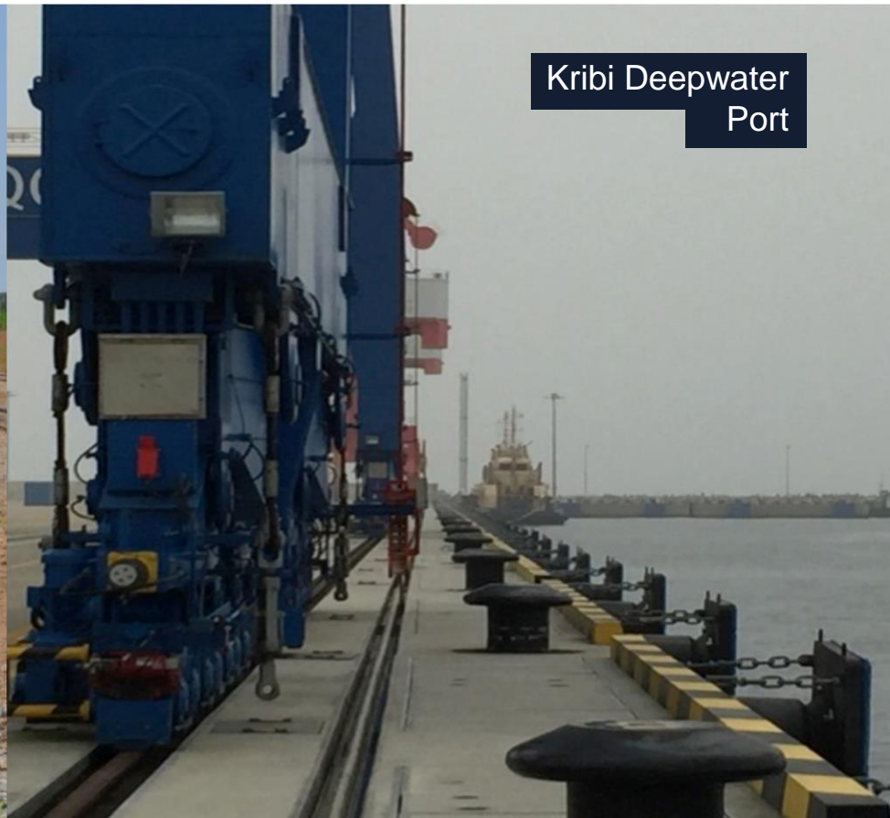
Kribi Deepwater Port