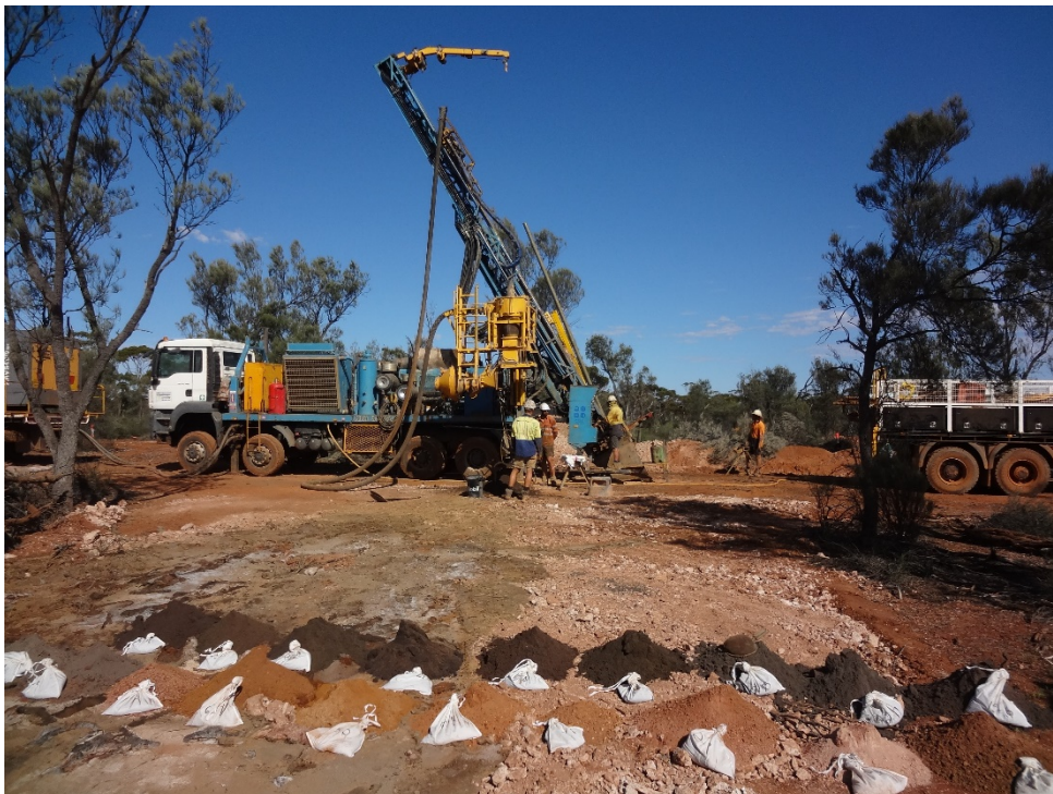
Figure 2 RC Drilling underway at Lucky Strike