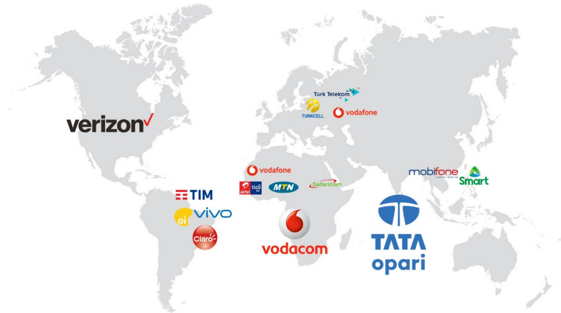
Syntonic Carrier Deployments: current and upcoming in Q3 FY19