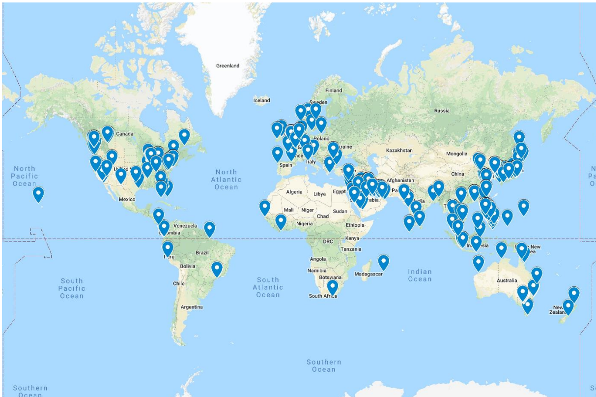
Sampling of RoamFree, powered by Freeway, locations as of 15-November-2018

Smart's RoamFree release has generated significant interest in the Freeway Roaming Services™ from other tier-1 mobile operators that are in various stages of business discussions with the Company.