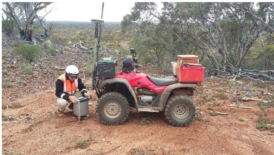
Figure 2 Gravity data collection in operation at Hang Glider Hill