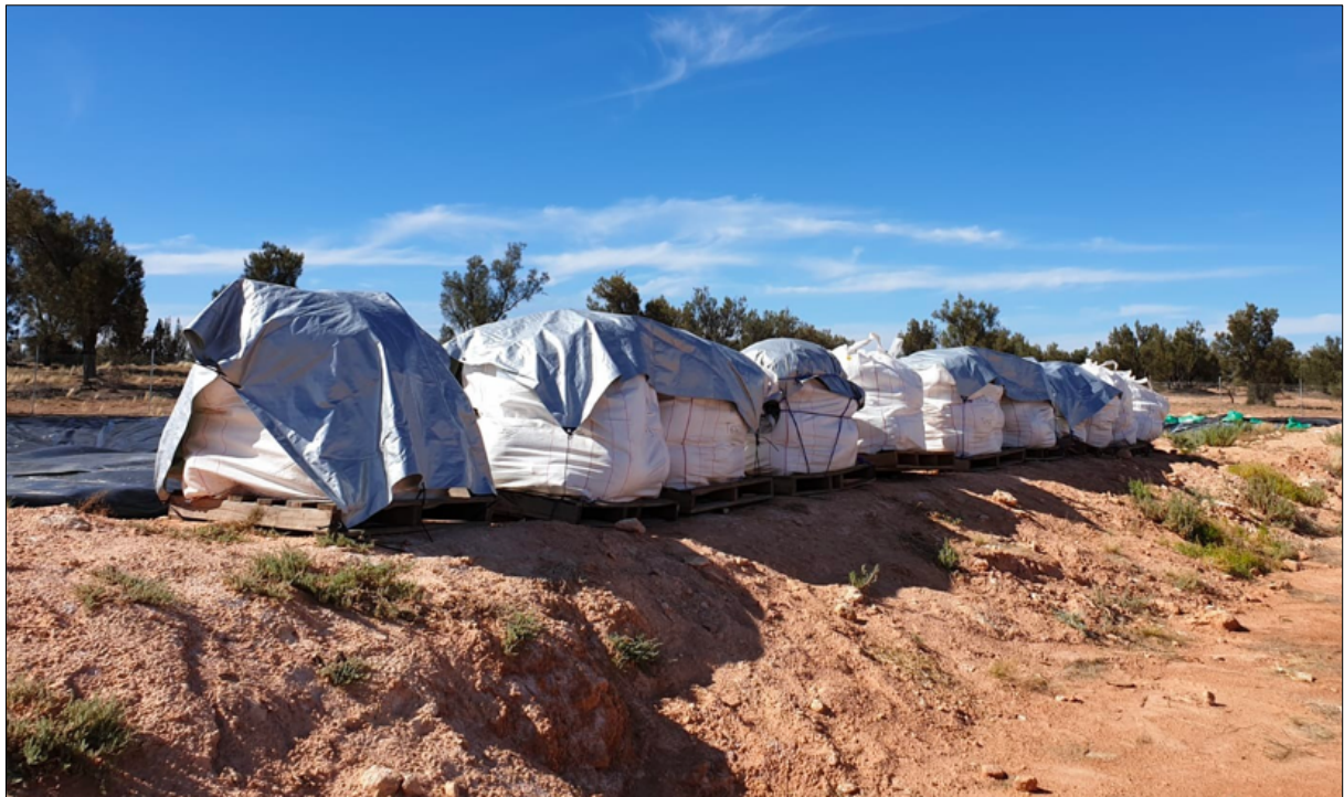
Figure 1: 11 tonnes of Potassium rich salts from the Lake Wells SOP project's Harvest Pond 1 ready for processing into Lake Wells Sulphate of Potash.

Australian Potash Limited (ASX: APC) (Australian Potash) is pleased to advise the successful completion of the final transfer of brine into Harvest Pond 3 at the Lake Wells Sulphate of Potash project's pilot evaporation pond network.