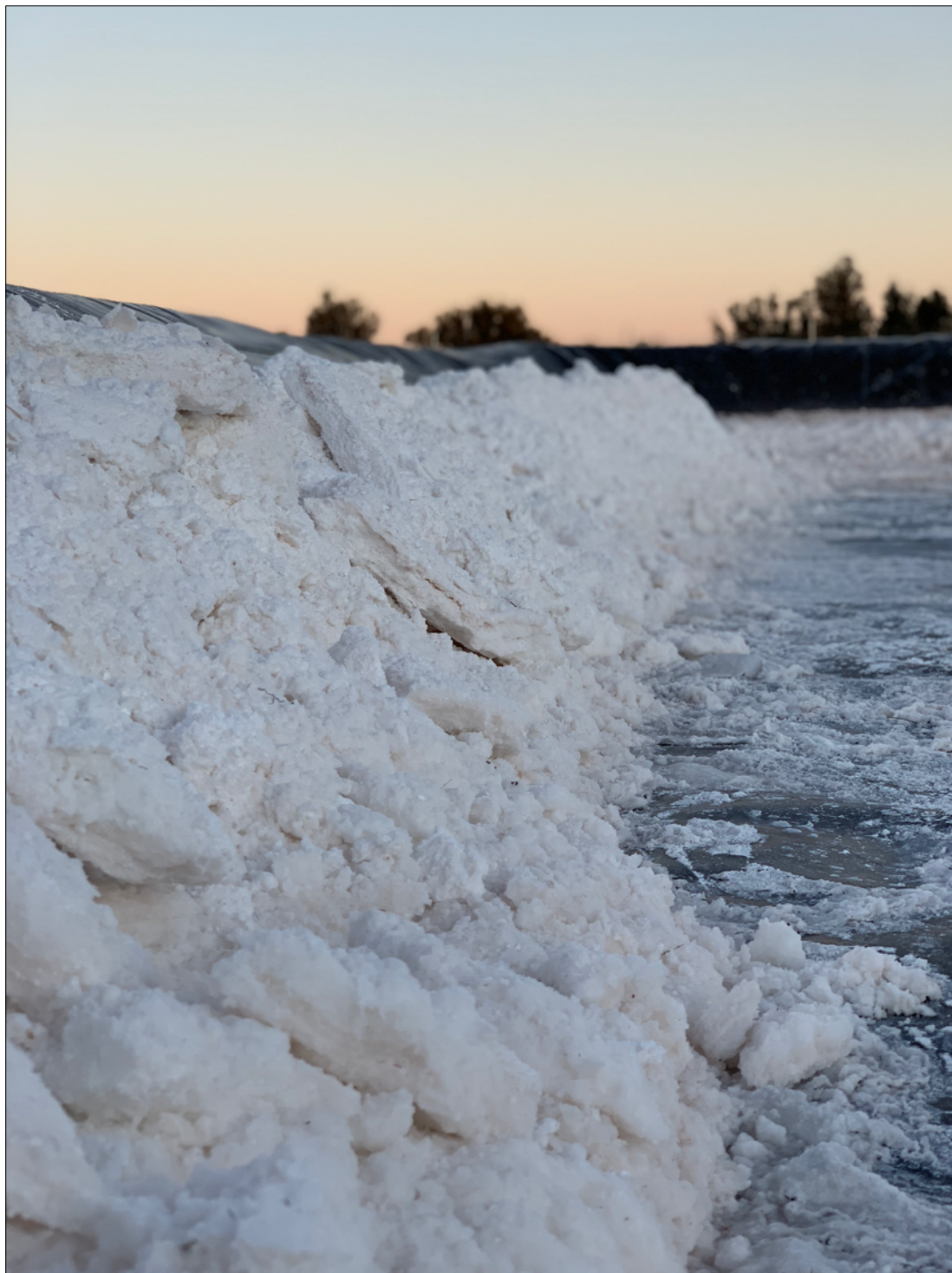
Figure 2: Harvest Pond 2 with crystallised potassium rich salts windrowed for draining prior to bagging, blending and transporting to Perth for refining into Lake Wells Sulphate of Potash.

SOP at the Company's purpose-built pilot processing plant. The production of SOP in Perth will be supervised by one of Novopro's expert engineers on secondment to APC.