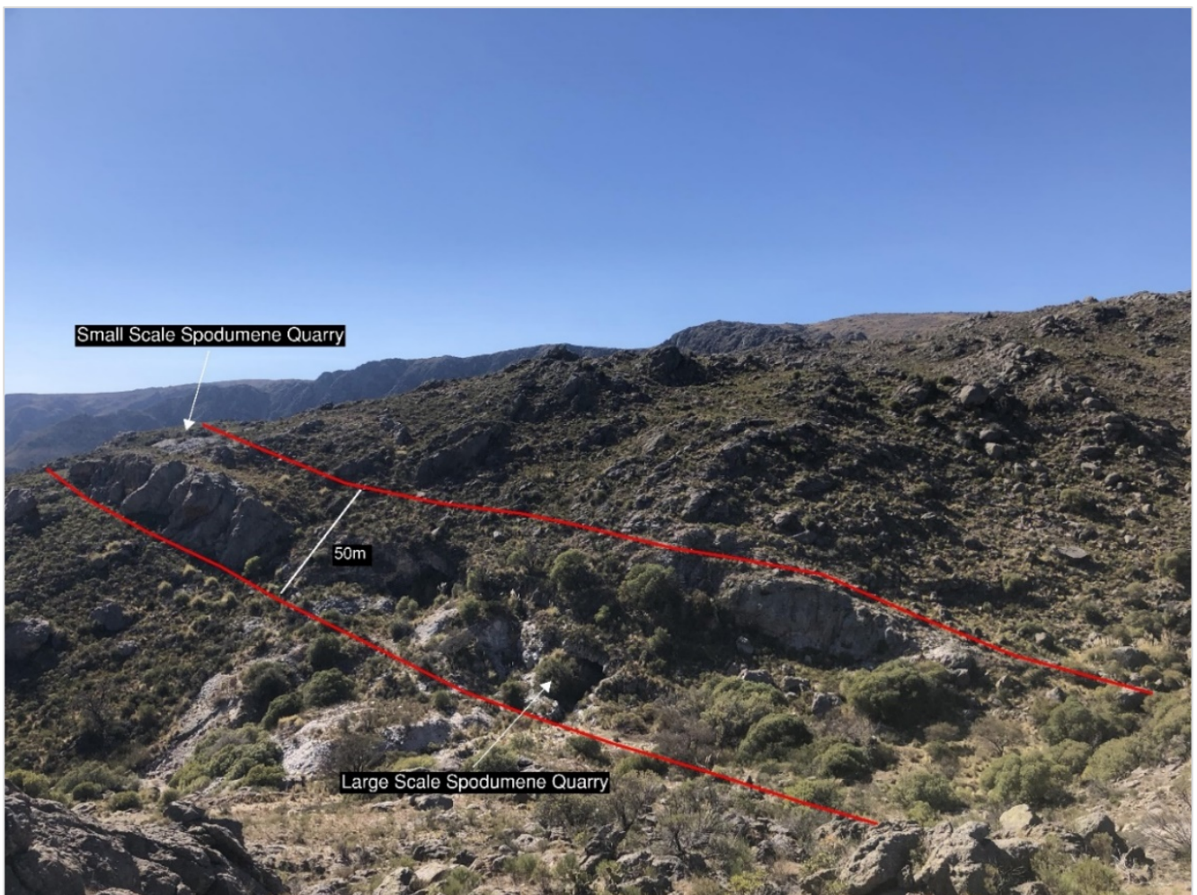
Figure 1- The Geminis Pegmatite

Once the permits have been approved drilling will commence on selected projects within San Luis where drill targets have already been identified.