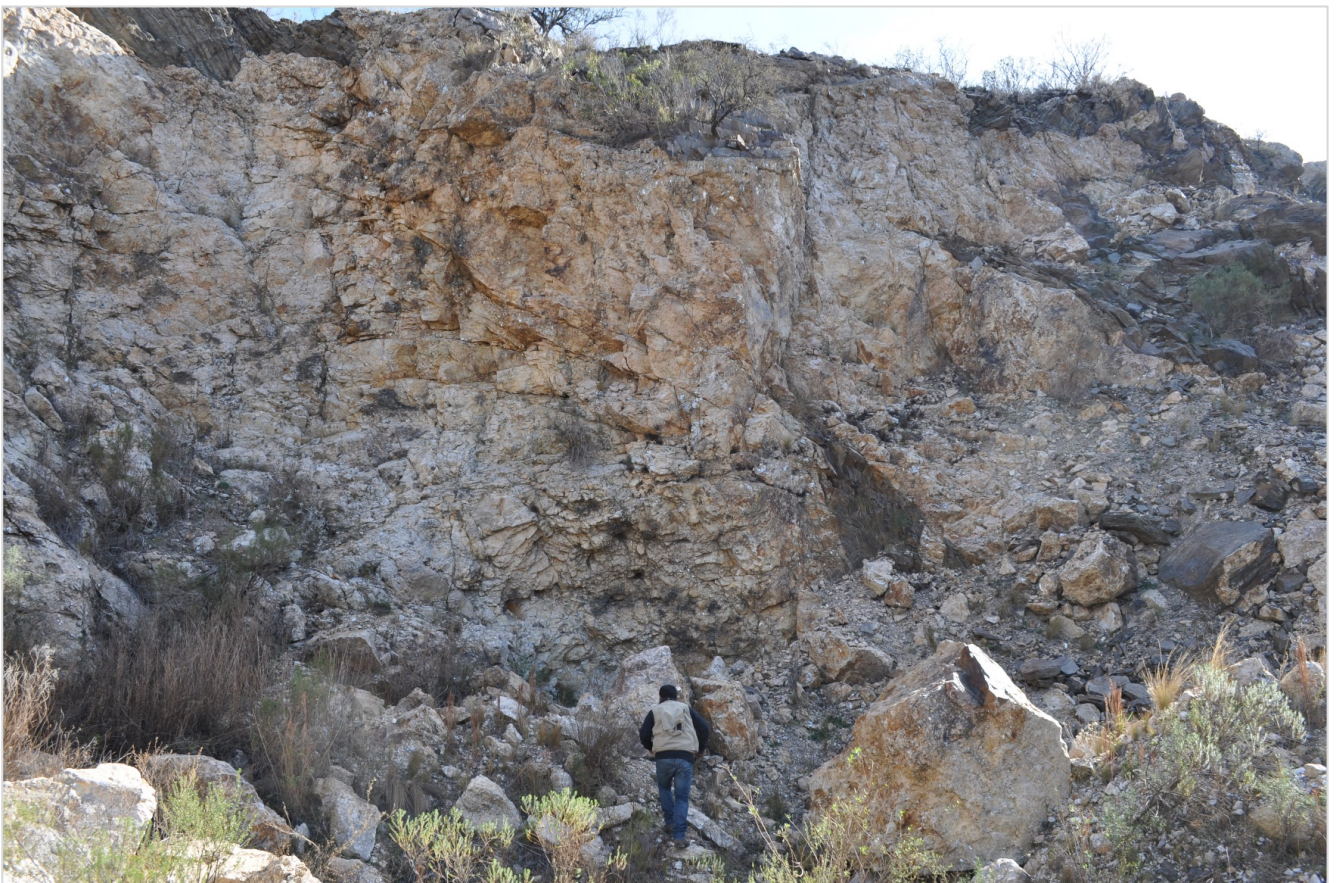
Figure 2 - Estanzuela spodumene pegmatite in San Luis

The early testing utilising a small portable rig will remove the costly aspect of road and pad construction and enable informed and de-risked investment decisions moving forward.