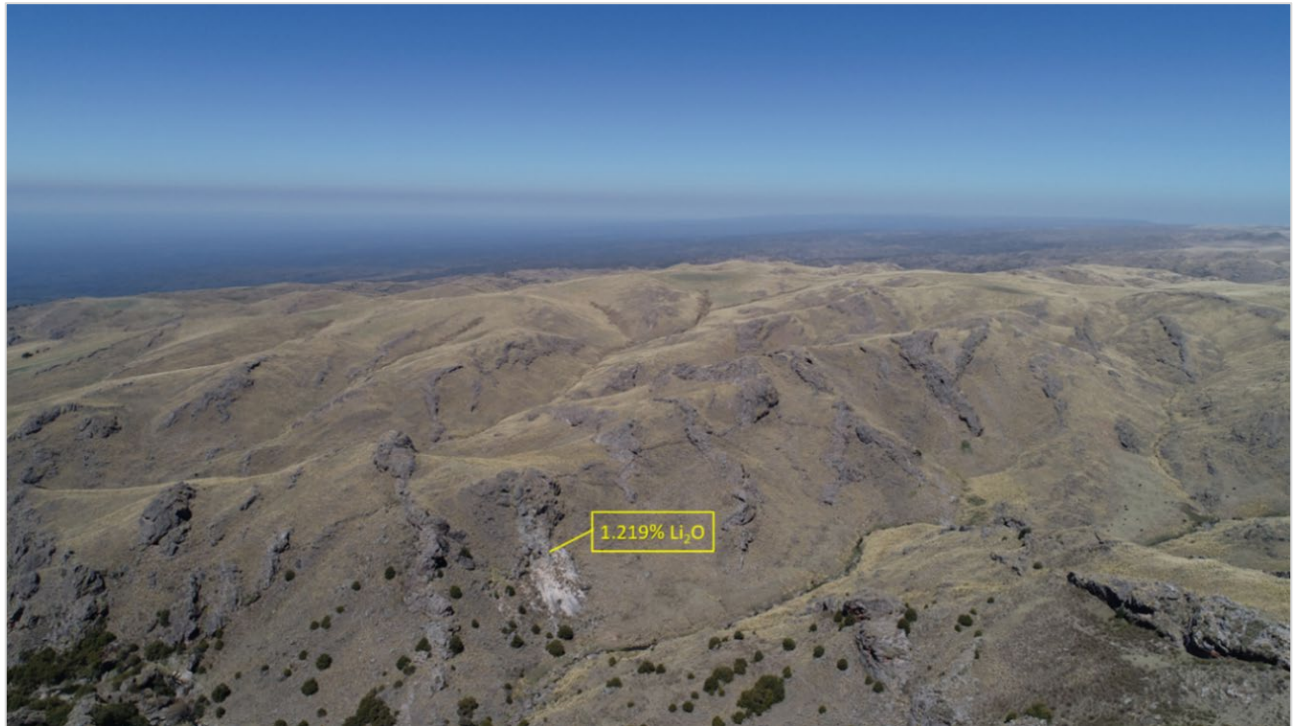
Figure 4 - Location of the 1.219% Li 2 O sample in the NW Alto. Note the location of numerous pegmatites in the region.

Drone footage of the NW alto pegmatites is available to view via the link below: