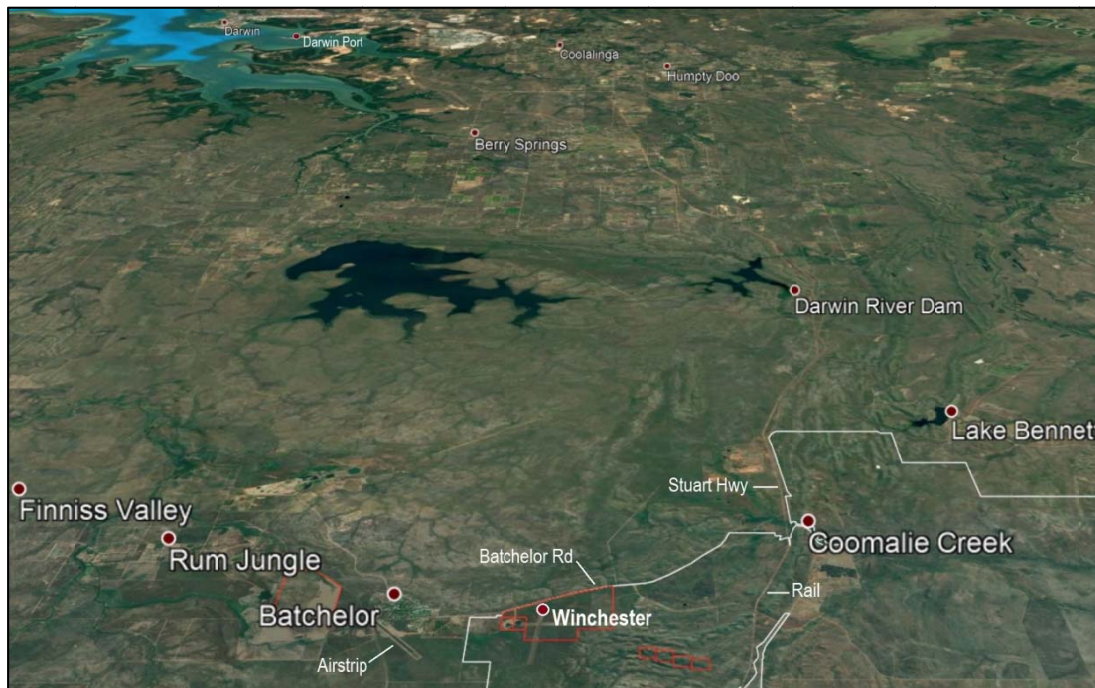
Figure 1 Location of Korab Group's mineral tenements and Winchester magnesium carbonate project relative to Darwin Port and basic infrastructure

Andrej K. Karpinski, Executive Chairman - Australia: (08) 9474 6166, International: +61 8 9474 6166