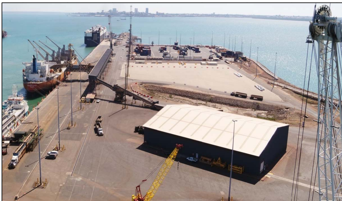
Figure 2 Darwin Port loading facilities (travelling gantry and autoloader)