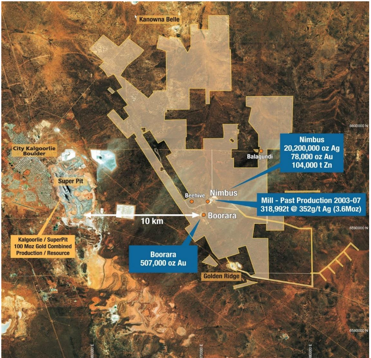
Figure 2: MacPhersons gold project locations and surrounding infrastructure

Intermin and MacPhersons are pleased to announce the signing of a Merger Implementation Agreement ( MIA ) to combine the two companies by way of a Scheme of Arrangement, subject to MacPhersons shareholder and court approval. The combined gold projects cover a total area of 1,100km 2 in close proximity to Kalgoorlie-Boulder in the world class Western Australian goldfields (Figures 1 and 2).