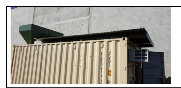
GIB diamond Sortex unit mounted within a sea container for ease of transport and security. Note twin feed hoppers top left and double roof for lowering unit temperature