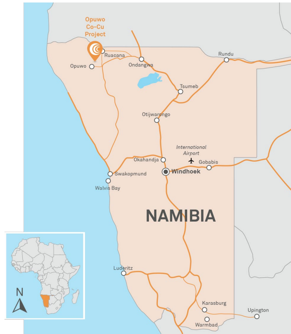
Figure 3: Location of the Opuwo Cobalt Project, Namibia