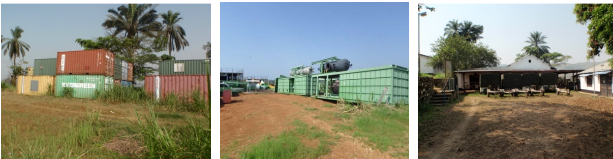
Figure 3, 4 and 5: Mechanical plant, equipment and storage and camp facilities at the Adidi-Kanga site

The Company will require further electrical and mechanical assessments prior to determining the full value and extent of potential use of this equipment in future operations.