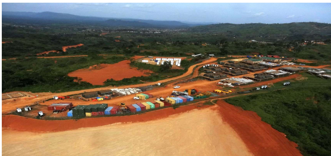
Figure 2: The Adidi-Kanga Gold Project - located on Mining License PE5105

The Adidi-Kanga Gold project comprises granted Mining License PE5105, one of 13 licenses extending over 5,033km 2 that were the subject of extensive exploration activities by AngloGold Ashanti.