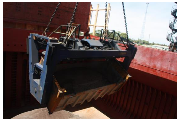
First HMC Loading at Bunbury Port, WA

Following on from the successful completion of wet commissioning of the HMC production facilities at Boonanarring at the end of November 2018, and a remarkable month of production during the first month of the production ramp-up period in December 2018, sufficient HMC has been produced to allow for a 10,000-tonne shipment.