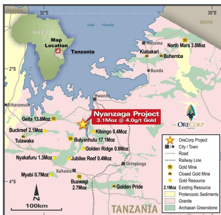
Figure 1: Lake Victoria Goldfields, Tanzania – Existing Resources

Nyanzaga is situated in the Archean Sukumaland Greenstone Belt, part of the Lake Victoria Goldfields ( LVG ) of the Tanzanian Craton. The greenstone belts of the LVG host several large gold mines ( Figure 1 ). The Geita Gold Mine lies approximately 60km to the west of the Project along the strike of the greenstone belt and the Bulyanhulu Gold Mine is located 36km to the southwest of the Project. The Nyanzaga Project comprises 20 contiguous Prospecting Licences ( PLs ) and two applications covering a combined area of 211km 2 . An SML application has been lodged over the Nyanzaga deposit and parts of the surrounding licences covering 23.4km 2 . In addition to the Nyanzaga deposit, there are a number of other exploration prospects within the Project licences.