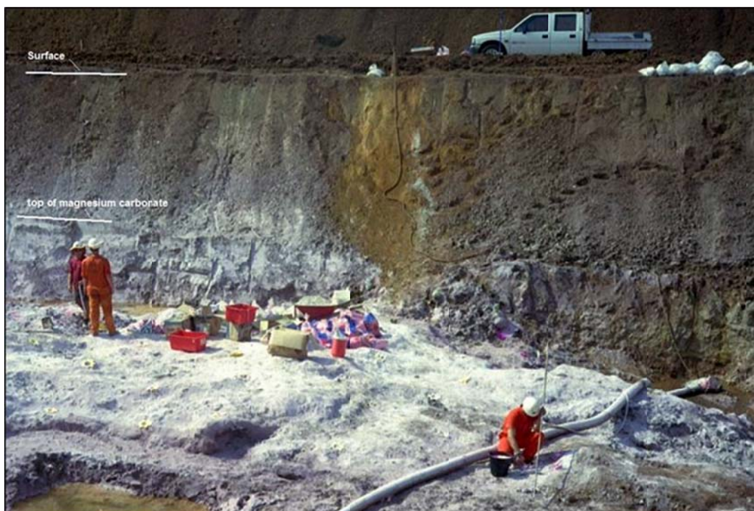
Figure 2 Test mining of magnesium carbonate at Winchester (setting of explosive charges)